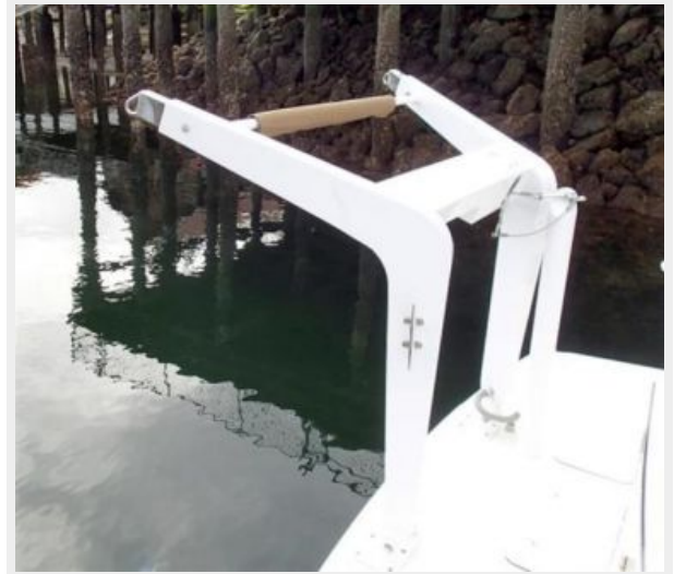
DC Davit System