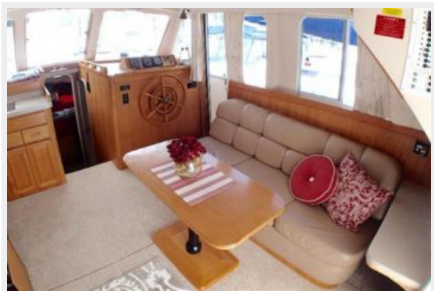
Salon Starboard Forward