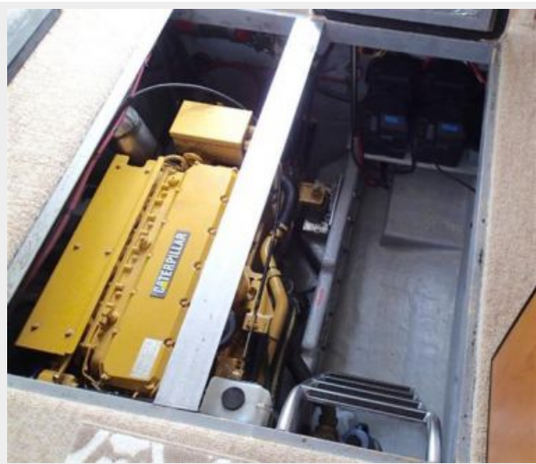
Engine Access Aft View