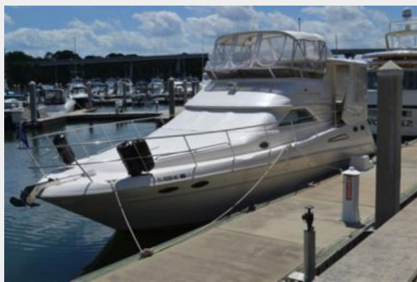
Port Bow at the Dock