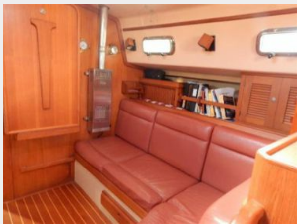
Salon - Starbd side ( heater)