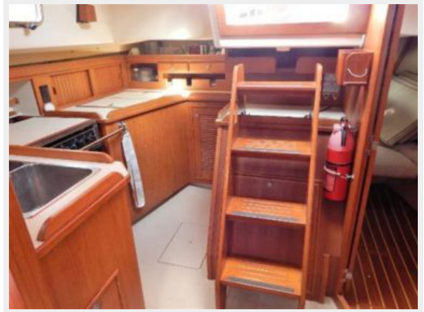
Galley - Companionway