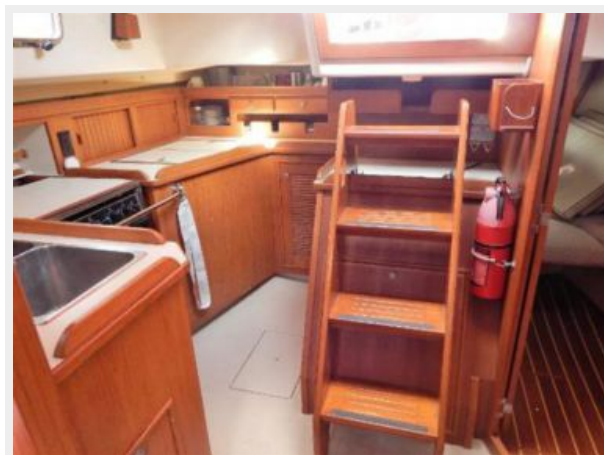
Galley - Companionway