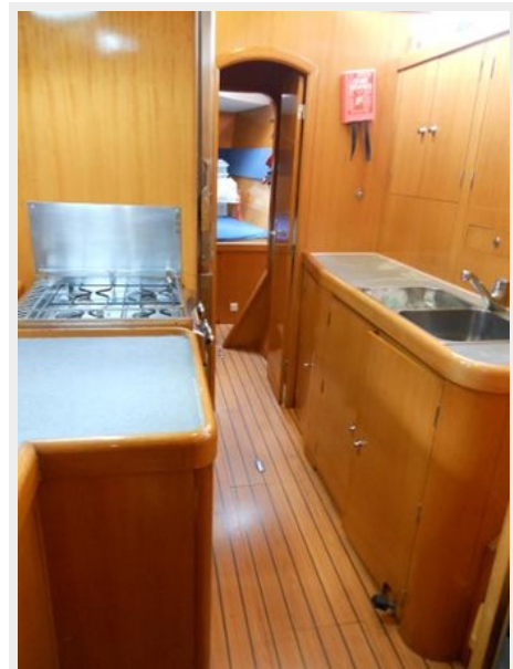
galley looking forward