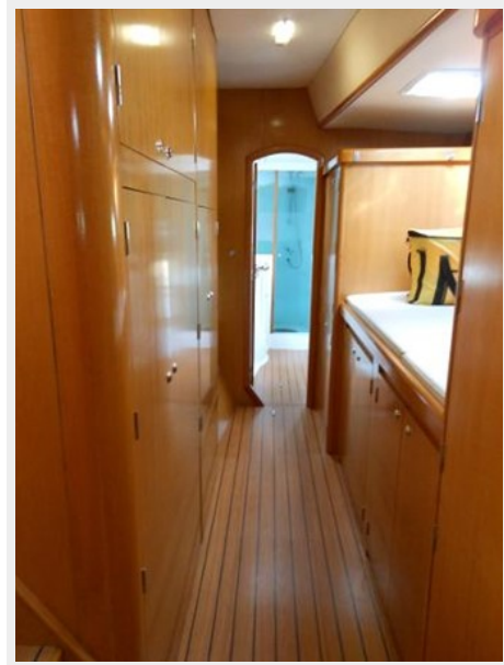
owner hull looking forward