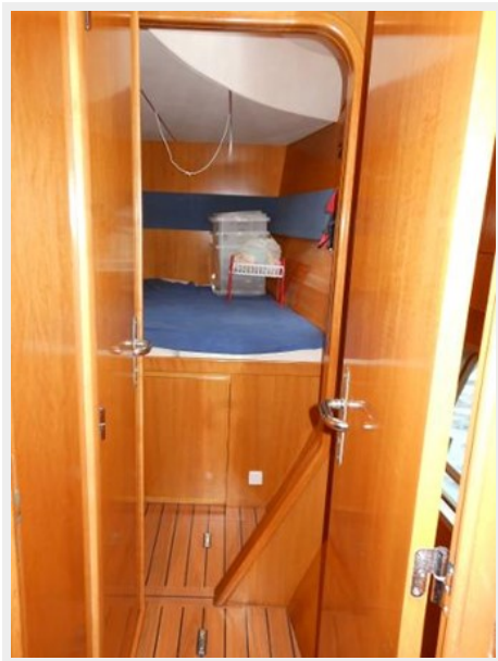
forward guest stateroom