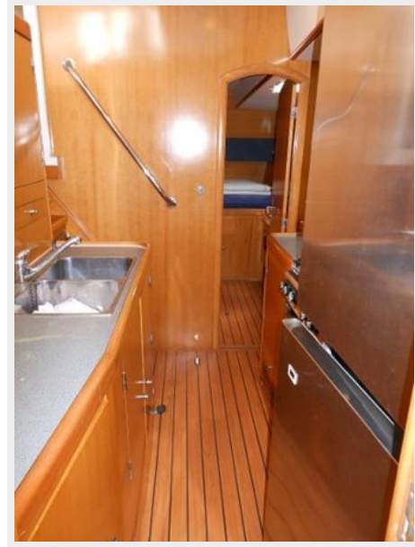
galley looking aft