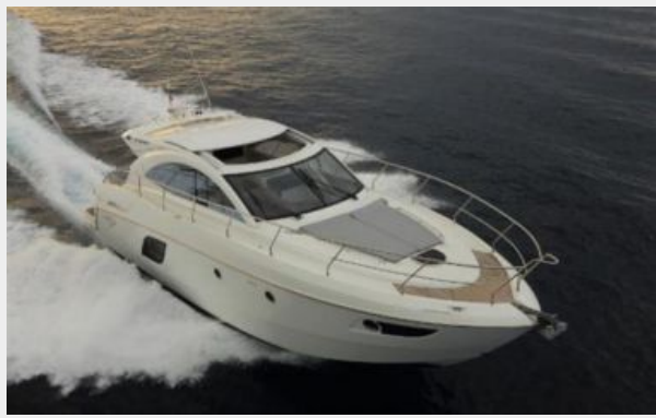
Running Shot 2