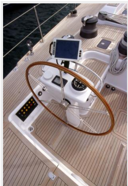
Ocean Horse cockpit