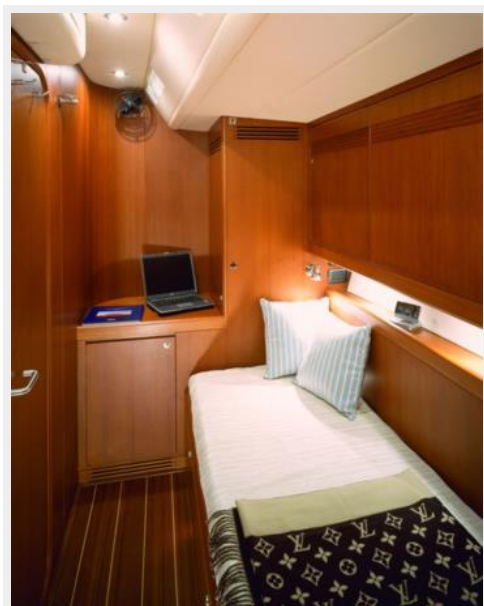
Ocean Horse saloon