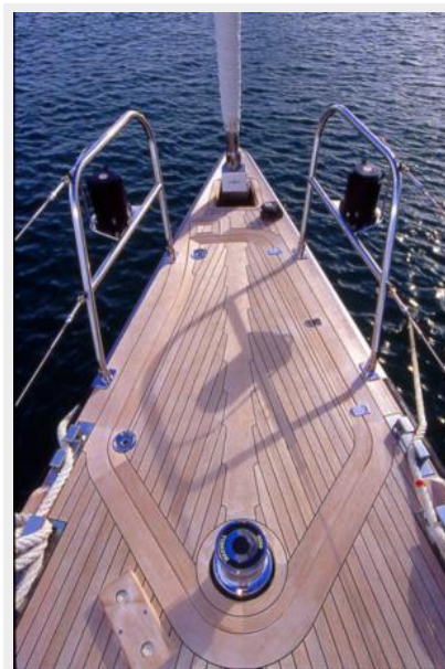
Ocean Horse bow