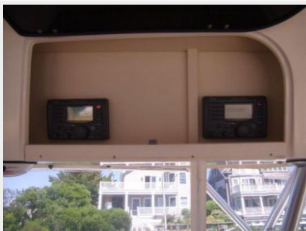
Helm / Electronics & Navigation 6