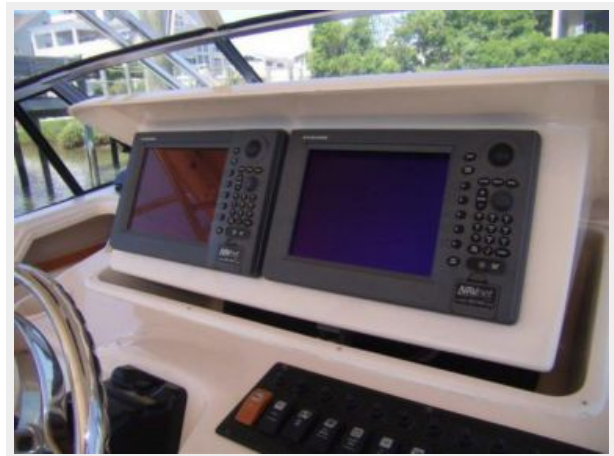
Helm / Electronics & Navigation 1