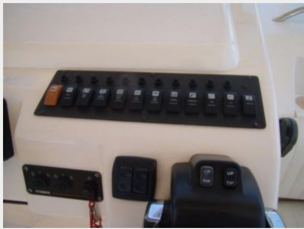
Helm / Electronics & Navigation 4