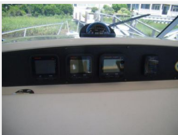
Helm / Electronics & Navigation 2