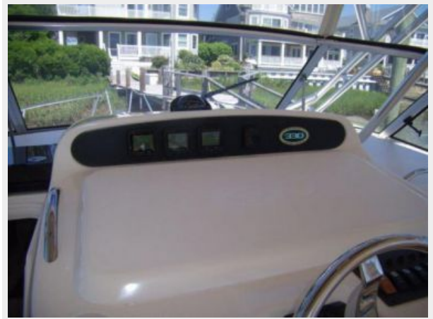
Helm / Electronics & Navigation 5