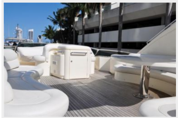
Flybridge and grill