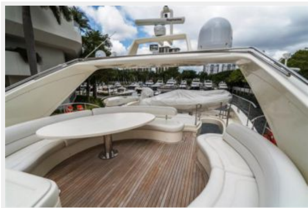
Flybridge to aft