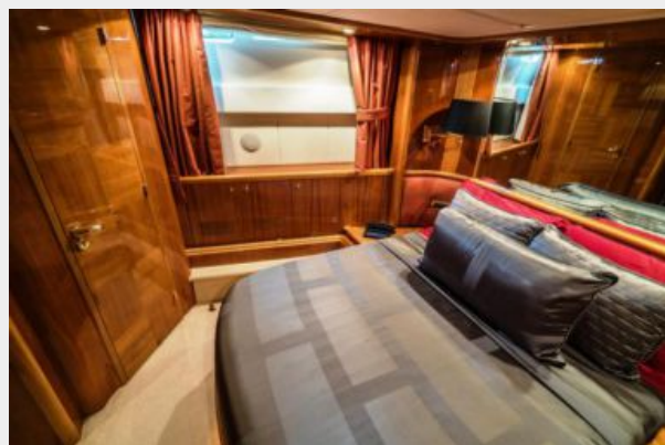
VIP - FWD