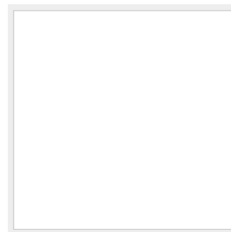
Salon Looking Aft to Starboard