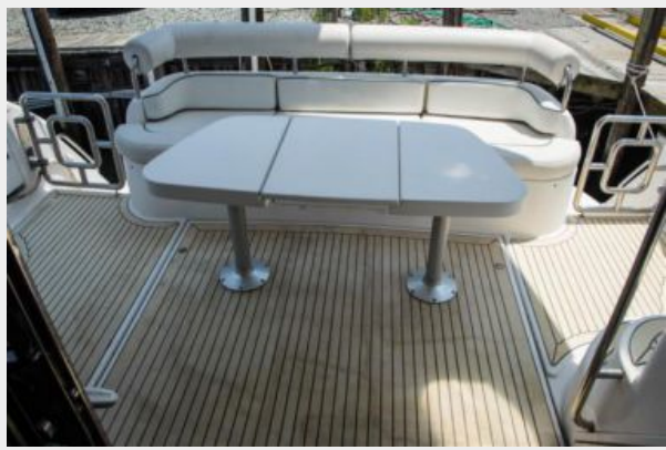
Cockpit Looking Aft