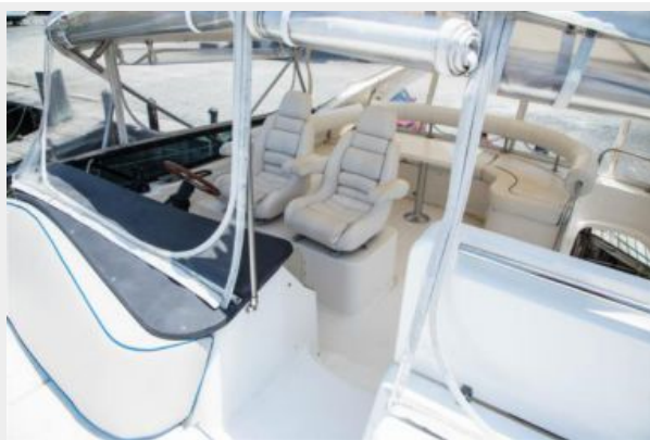
Fwd Bridge access to Sunpad