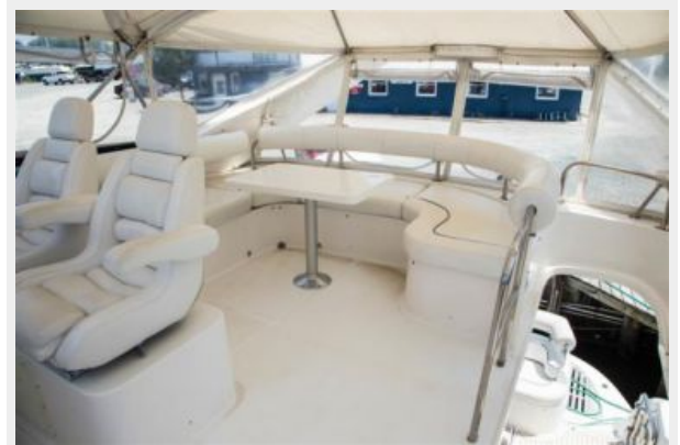
Aft Bridge Settee for five