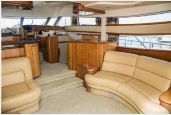
Salon Starb. Sofa