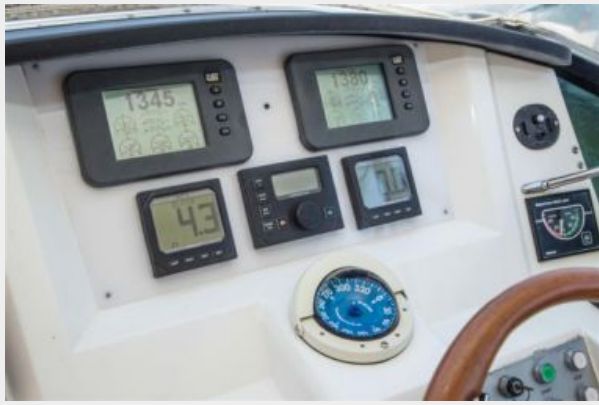
Electronic CAT Guages