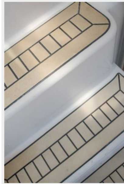
Composite teak in cockpit