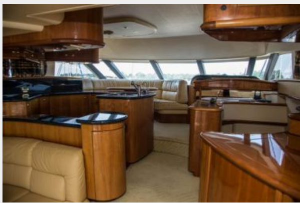
Salon Looking fwd