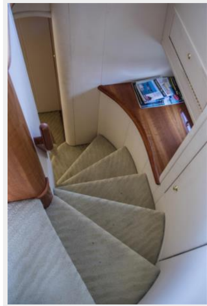
Lower cabin stairs