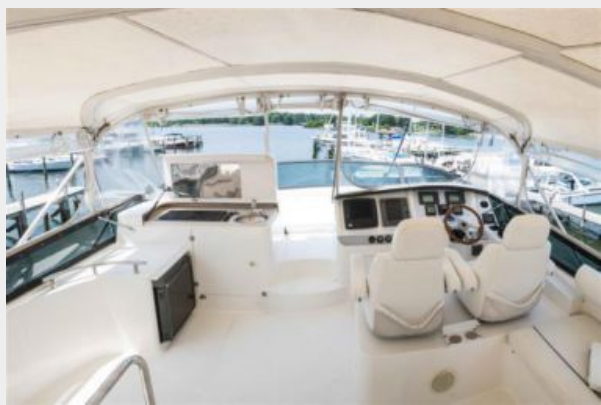
Bridge looking forward