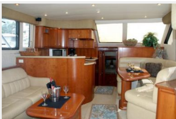
Salon Forward View