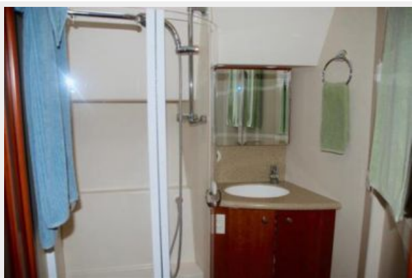
Master Ensuite Head