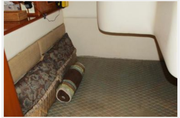
VIP Stateroom Starboard