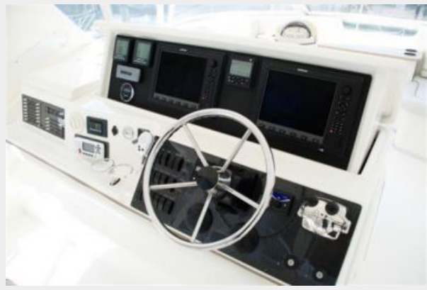
Navigation Panel Raised