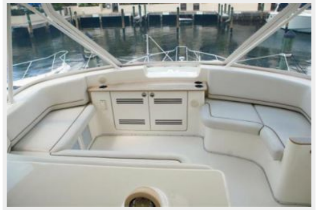
Flybridge Guest Seating