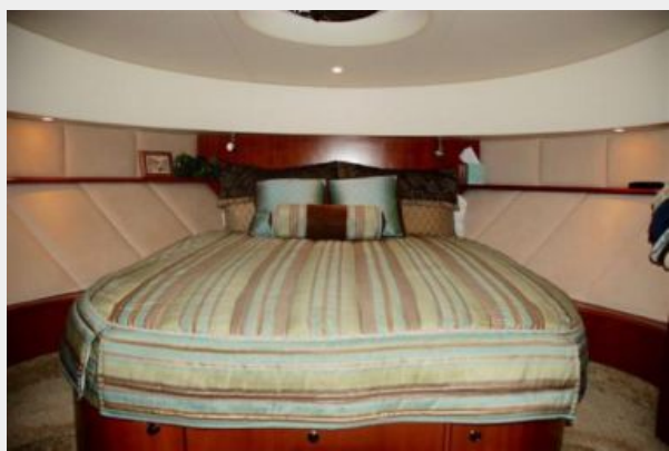
Master Stateroom Forward