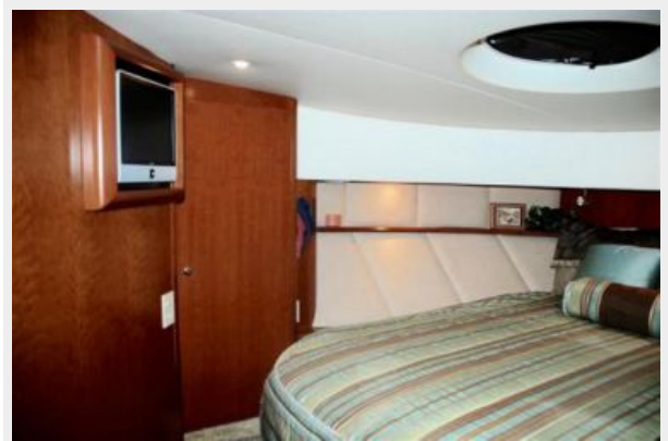
Master Stateroom Side View