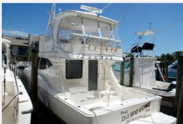
Vessel Stern View Portside