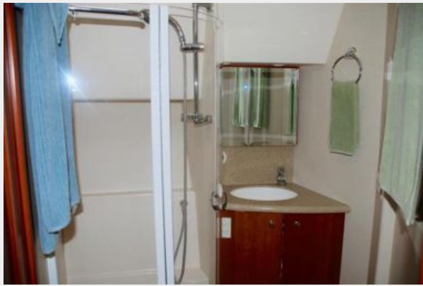
Guest Head Port