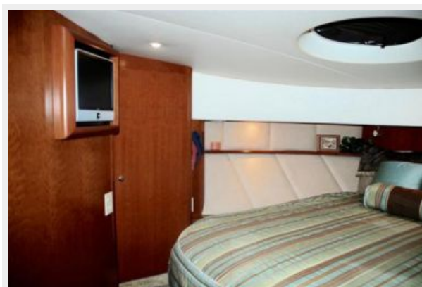
Master Stateroom Side View