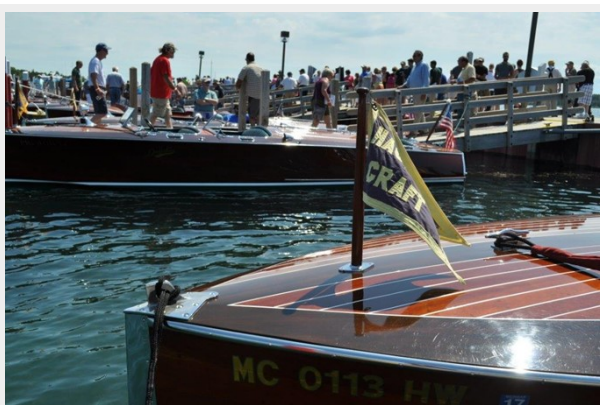
Displayed at a major antique boat show