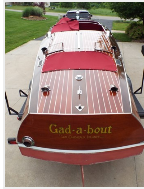
Individual cockpit covers