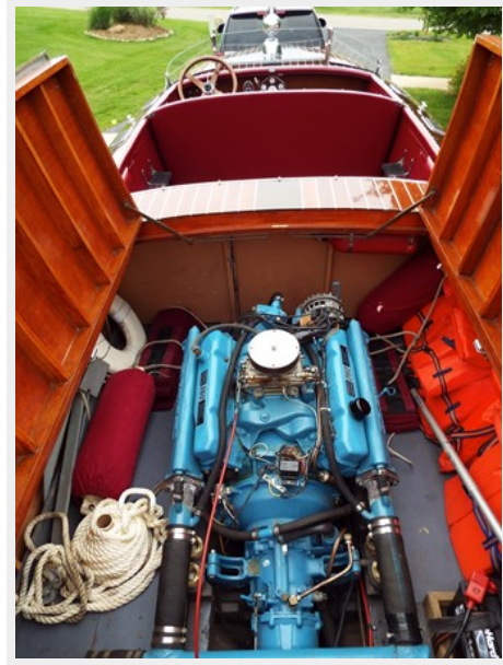
Spacious engine compartment