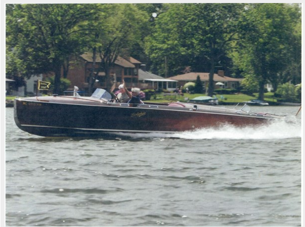
There is no sound like the rumble of a woodie