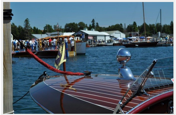
Original bow light with spot