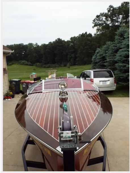
Incredible wood detailing