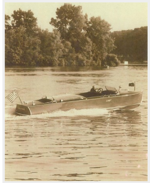
A timeless classic!