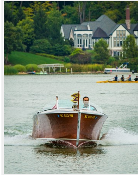
Note the crisp bow wake