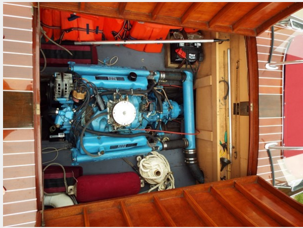
Reliable V8 power