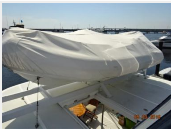
49' DeFever tender covered