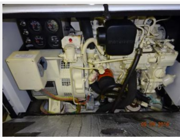
49' DeFever 5 kW generator