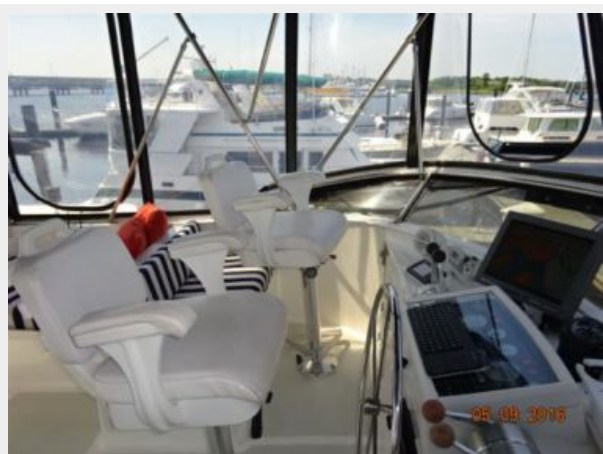
49' DeFever flybridge port