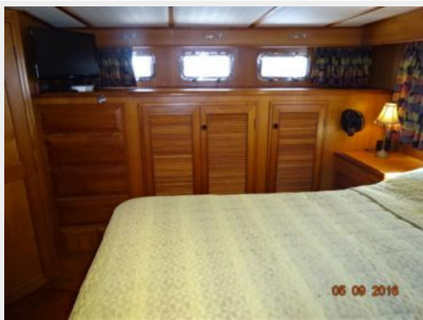
49' DeFever master stateroom starboard