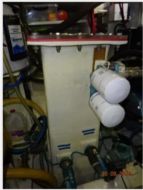
49' DeFever sea chest