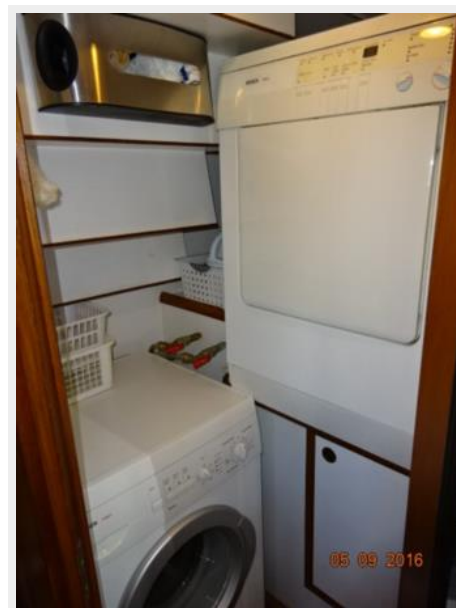
49' DeFever washer-dryer