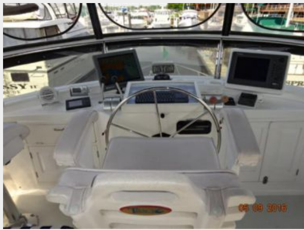
49' DeFever flybridge helm