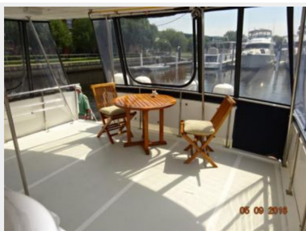
49' DeFever sundeck photo2