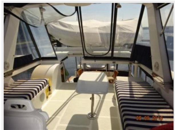
49' DeFever flybridge aft