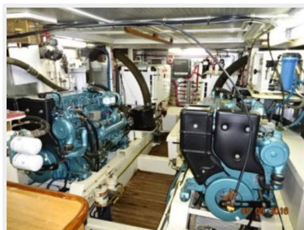
49' DeFever engine room aft