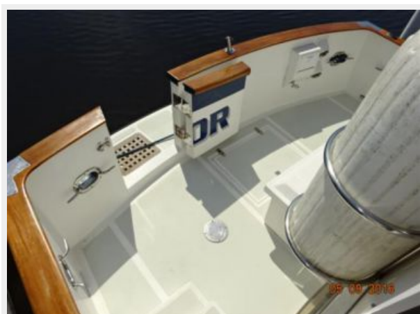
49' DeFever cockpit