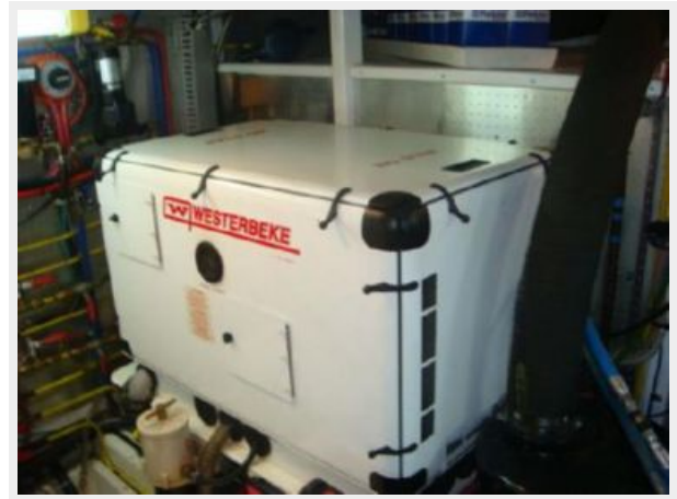
49' DeFever 5 kW generator Racor fuel filter