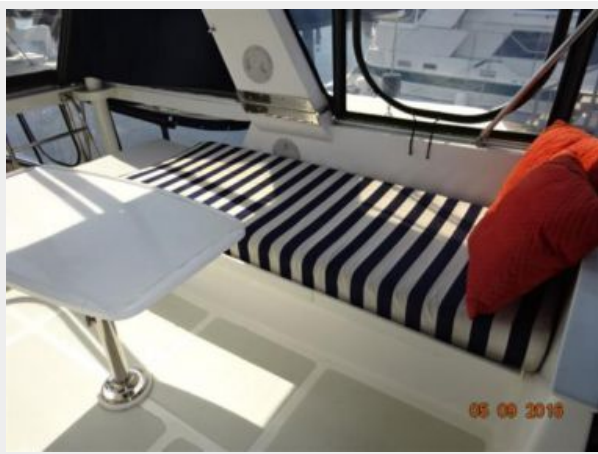
49' DeFever flybridge port aft seating