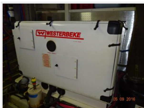
49' DeFever 12.5 kW generator soundbox