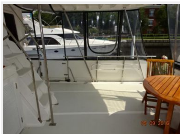
49' DeFever sundeck starboard