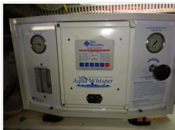
49' DeFever watermaker