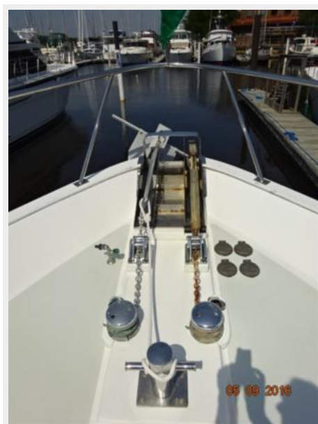
49' DeFever anchor windlass