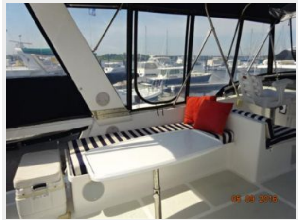
49' DeFever flybridge port aft