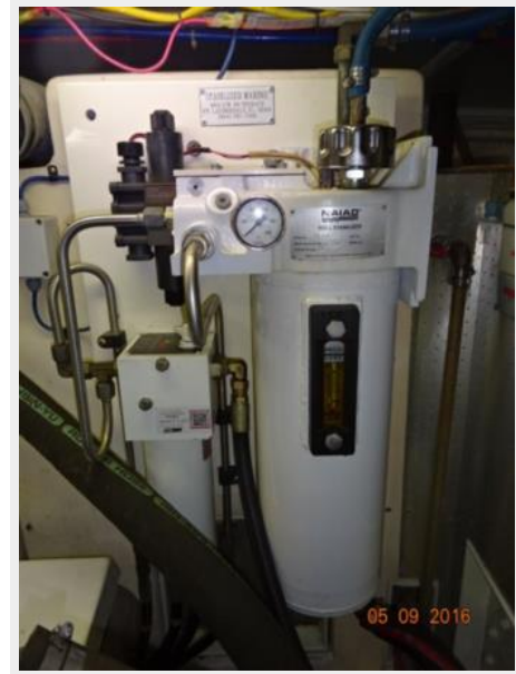
49' DeFever stabilizer system