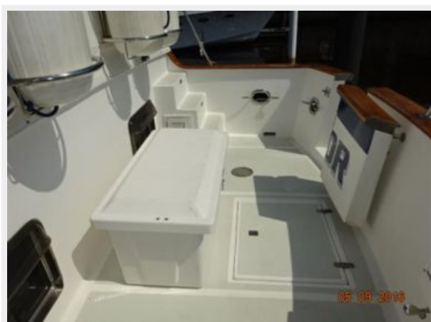
49' DeFever cockpit starboard