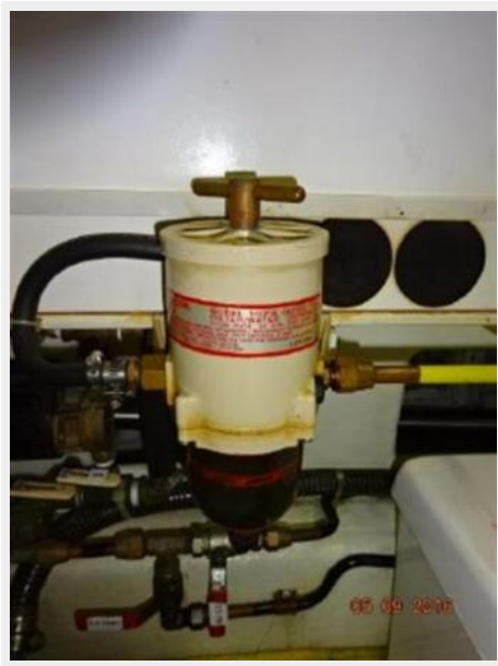
49' DeFever 12.5 kW generator Racor fuel filter