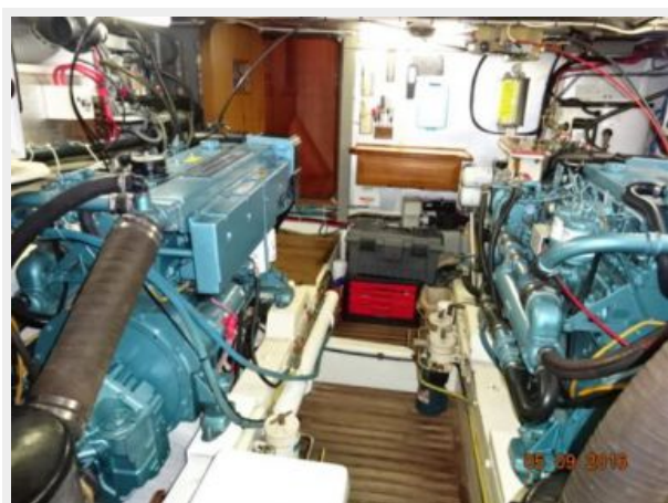
49' DeFever engine room forward