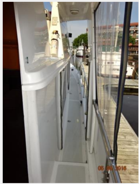
49' DeFever starboard side deck photo1