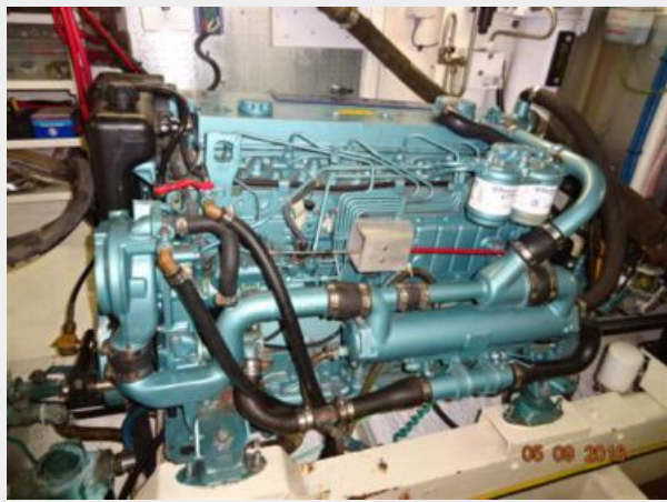
49' DeFever starboard main engine