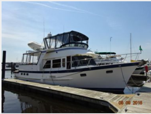
49' DeFever starboard forward profile photo2