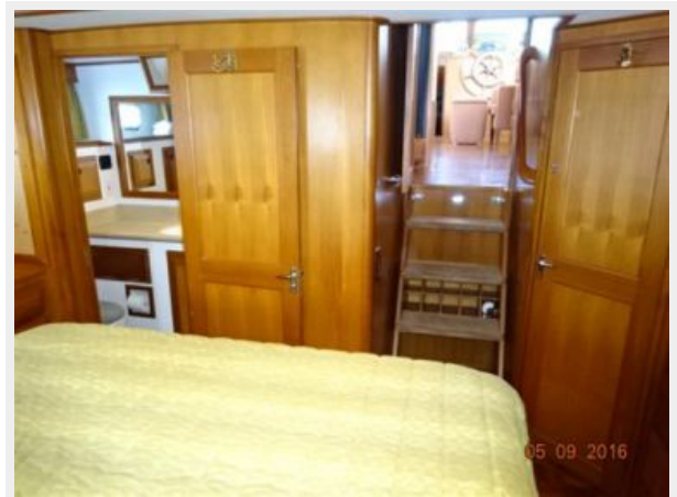
49' DeFever master stateroom forward