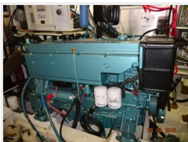
49' DeFever port main engine