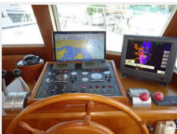
49' DeFever lower helm photo3