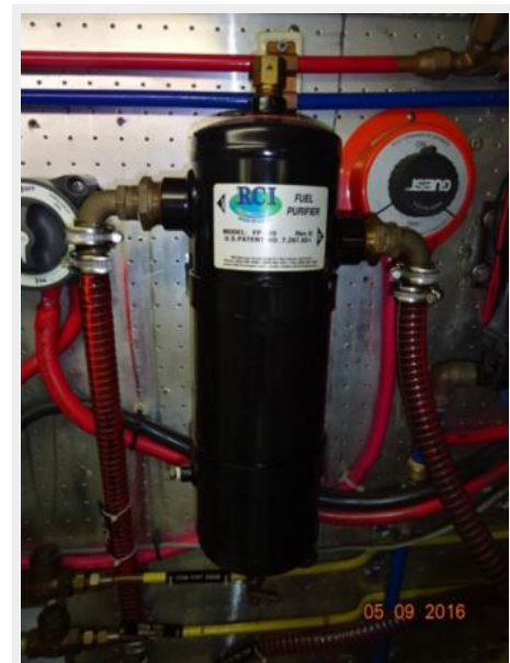
49' DeFever fuel purifier system