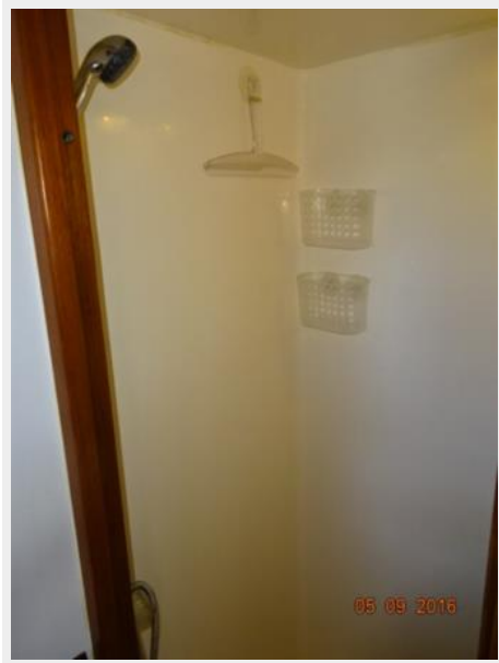
49' DeFever master stateroom shower