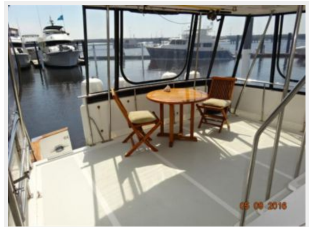
49' DeFever sundeck photo1