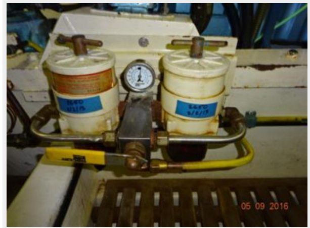
49' DeFever fuel purifier system