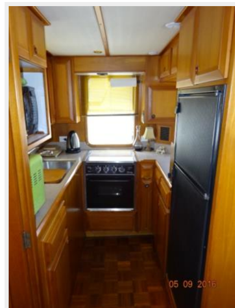
49' DeFever galley photo1