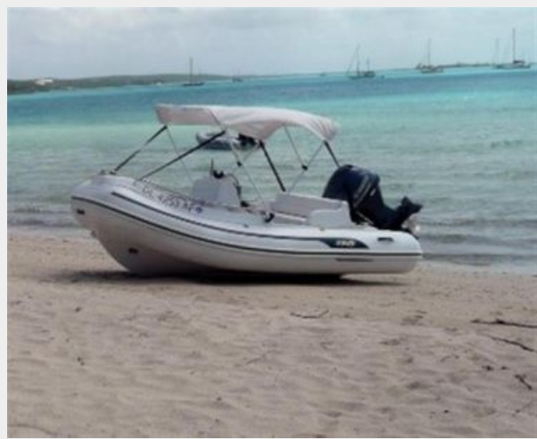
49' DeFever tender photo2