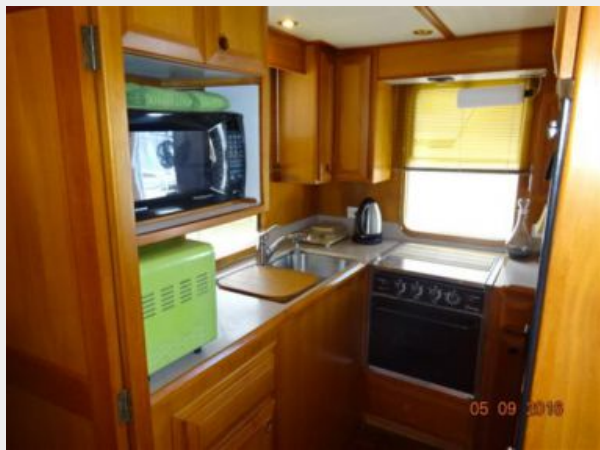
49' DeFever galley photo2