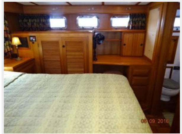
49' DeFever master stateroom port