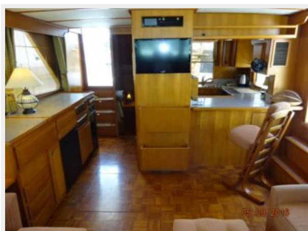
49' DeFever salon aft