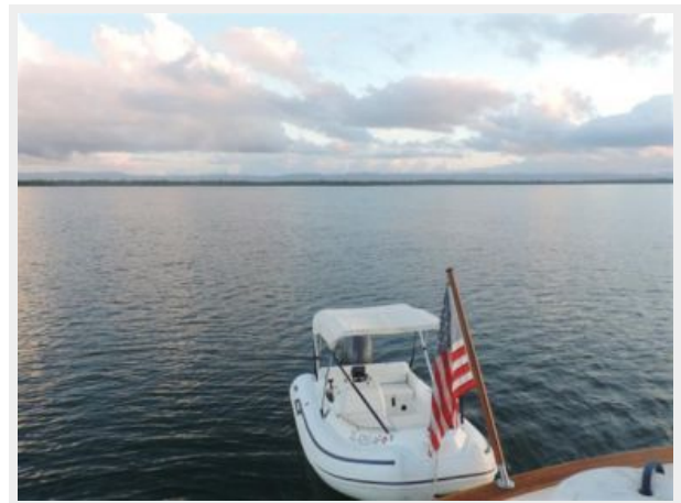
49' DeFever tender photo3