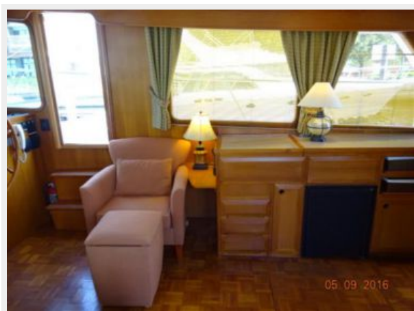
49' DeFever salon starboard