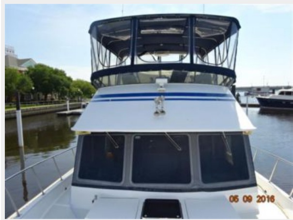
49' DeFever foredeck aft