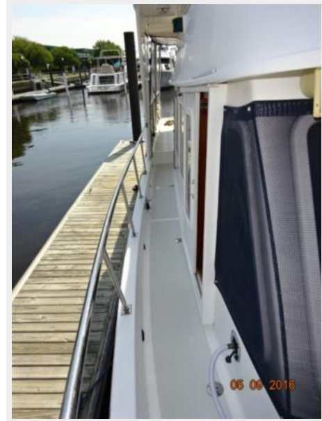
49' DeFever starboard side deck photo2