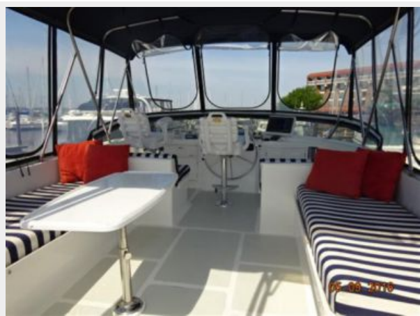
49' DeFever flybridge forward