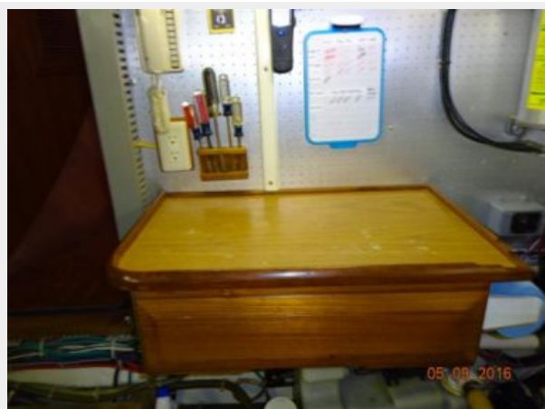
49' DeFever engine room work bench