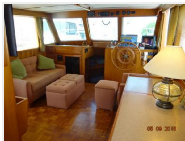
49' DeFever salon forward