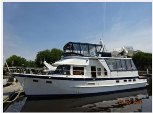
49' DeFever port profile