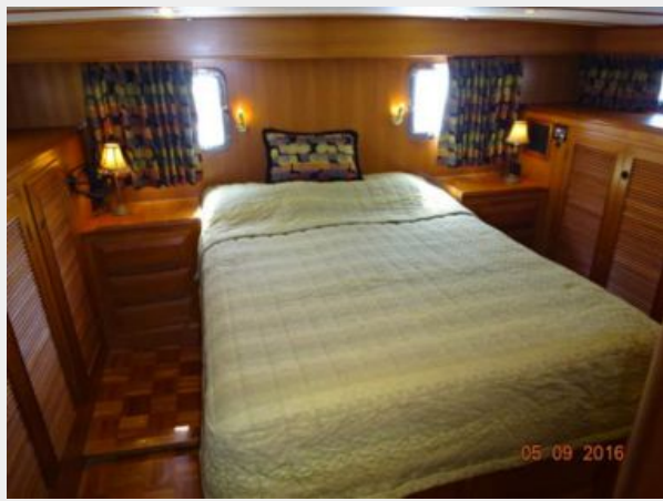
49' DeFever master stateroom