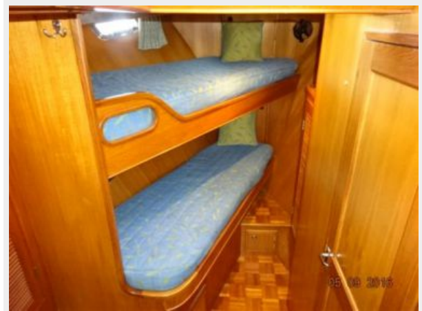
49' DeFever guest stateroom