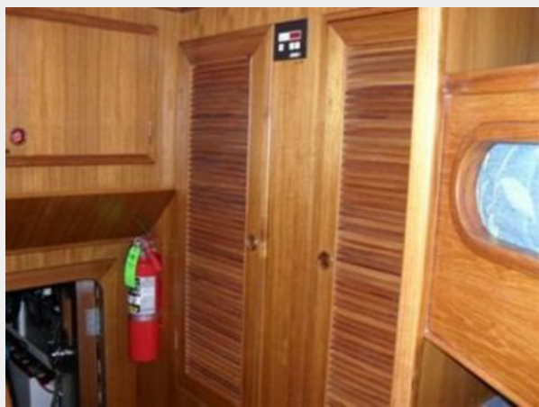
49' DeFever guest stateroom lockers