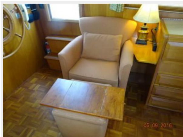
49' DeFever salon starboard lounge chair photo2