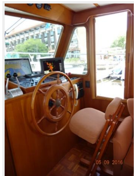
49' DeFever lower helm photo2