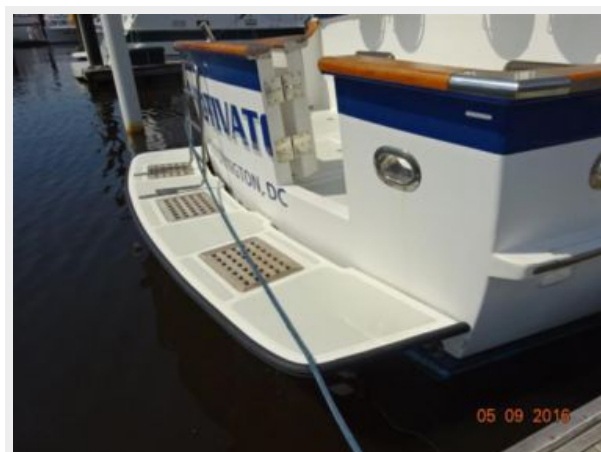
49' DeFever cockpit port