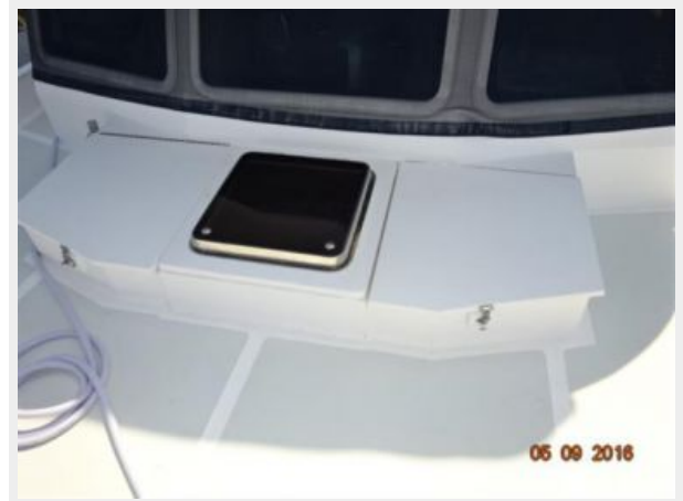
49' DeFever foredeck storage