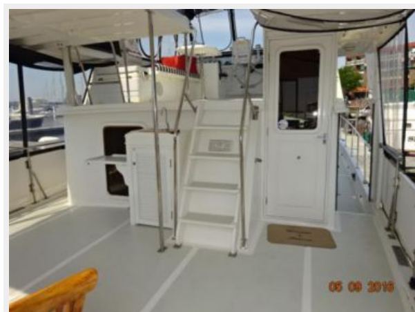
49' DeFever sundeck forward