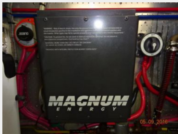
49' DeFever inverter/charger