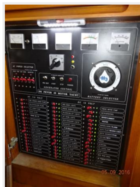
49' DeFever electrical panel