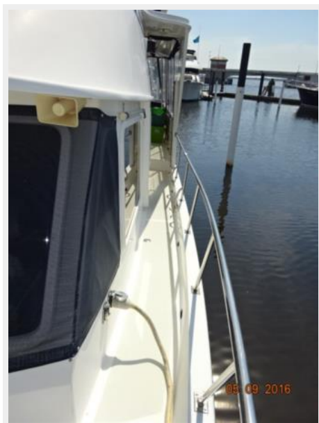
49' DeFever port side deck photo1