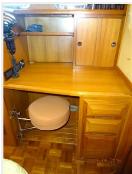
49' DeFever master stateroom desk