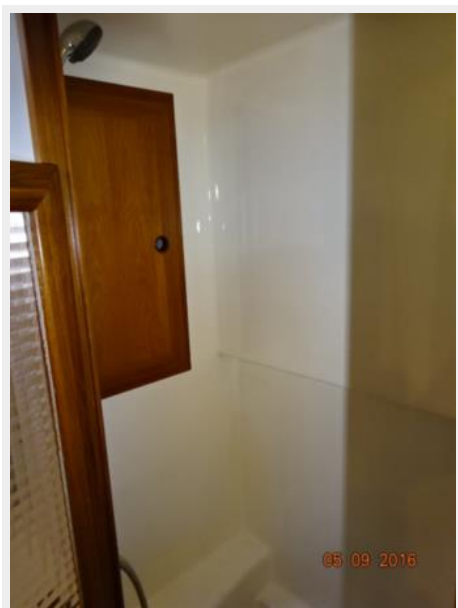
49' DeFever guest stateroom shower