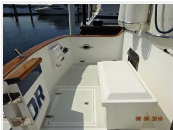
49' DeFever swimplatform