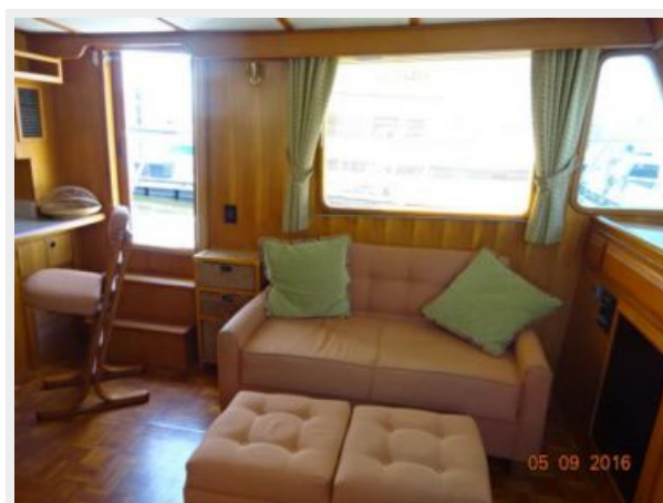
49' DeFever salon port