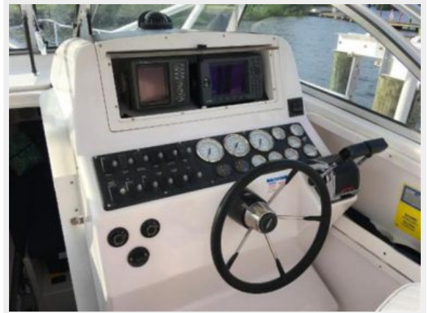
Garmin 3006C GPSmap