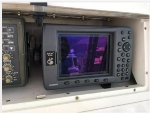
Garmin 3006C GPSmap