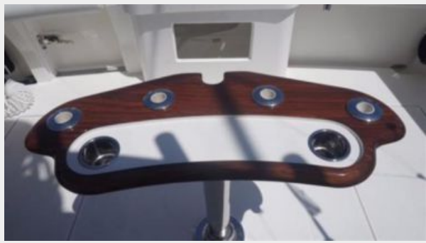
Release Rocket Stand