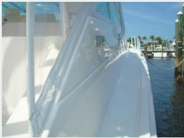
Gel Coat like new