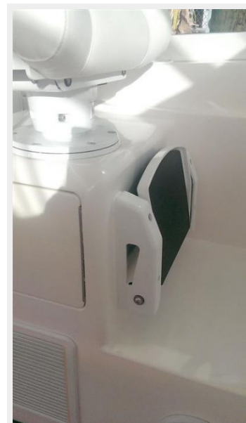
Stidd foot rests