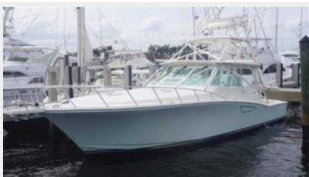
Second Port View