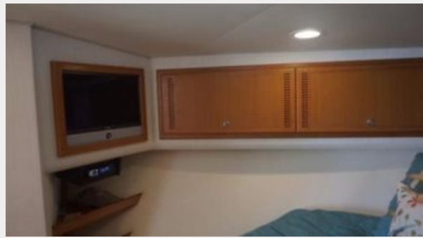
Master Storage with TV

Master Stateroom with private access to head, overhead skylight, lots of storage, TV and a very comfortable mattress.