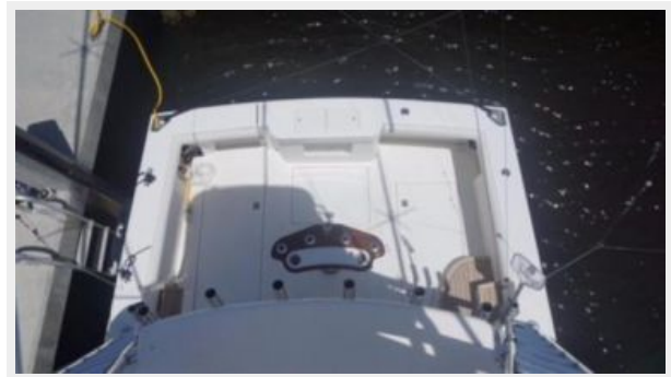
Aft Deck from Tower Above