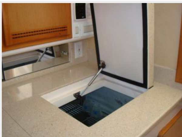
Galley deep freezer box