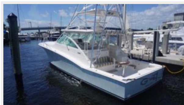
Port Aft Profile