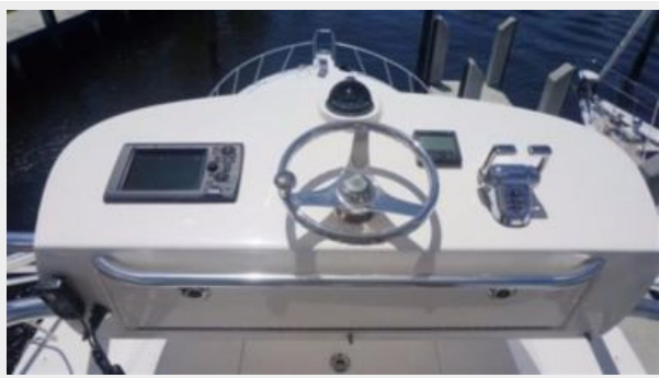
Tower Helm Controls and Electronics