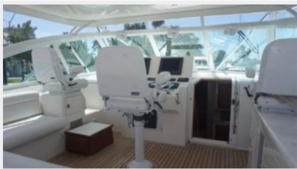
Bridge with 3 Stidd Chairs, Teak and AC