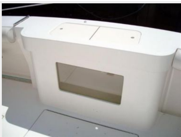
Lighted Bait Well