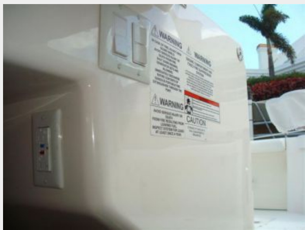
Engine Room AC compressors