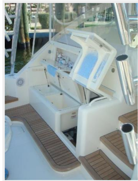
Custom Mezzanine storage, freezer, eng room door 2014