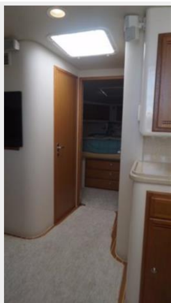
View to hall and master stateroom beyond