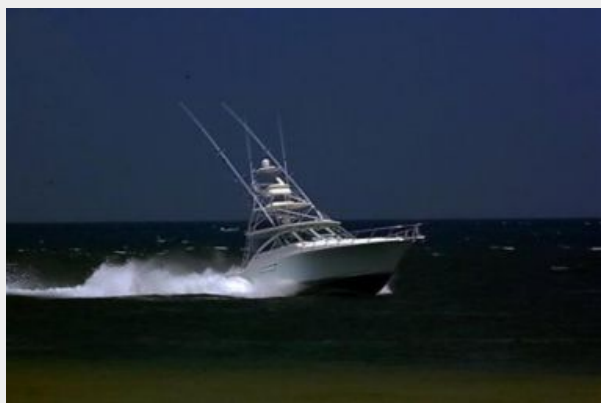
Running 35 knots