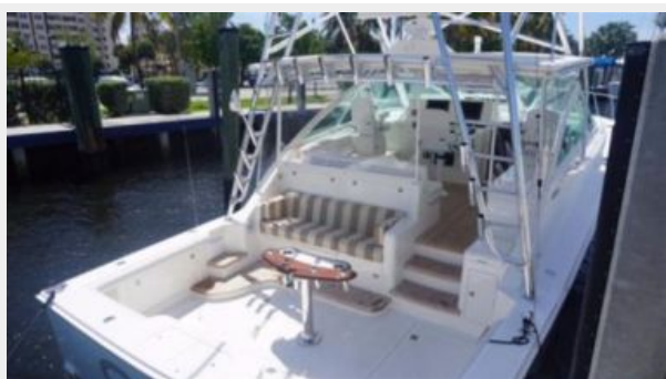
Aft Cockpit with View of Custom Mezzanine