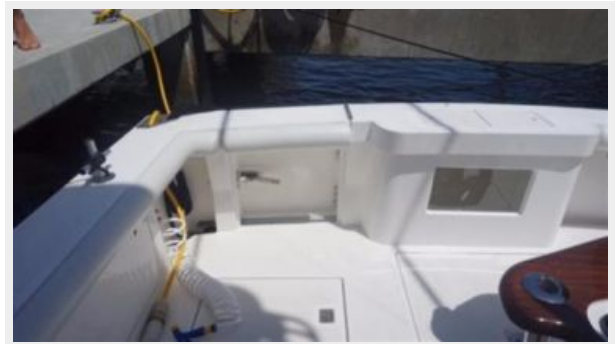
Tuna Door and Live Bait Well