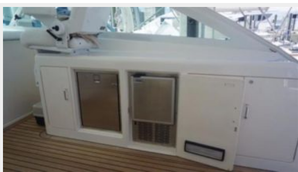
Storage Cabinet with New Refrigerator and Ice Maker