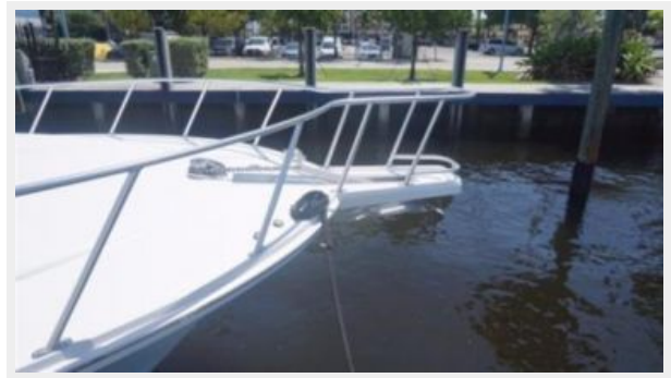
Bow with Windlass and Pulpit