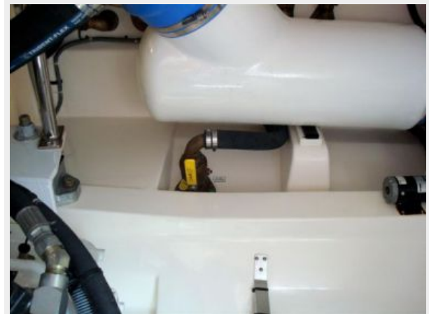
Stainless steel water heater