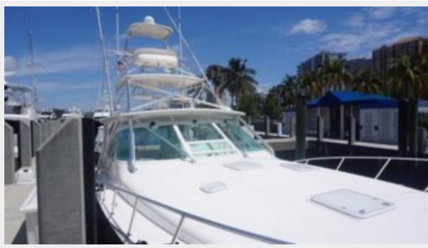
Fore Deck with View of Tower