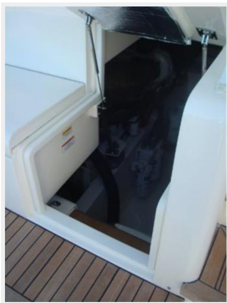
Custom ER door