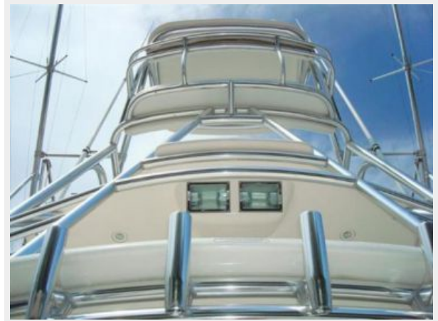
Pipewelders Marlin Tower