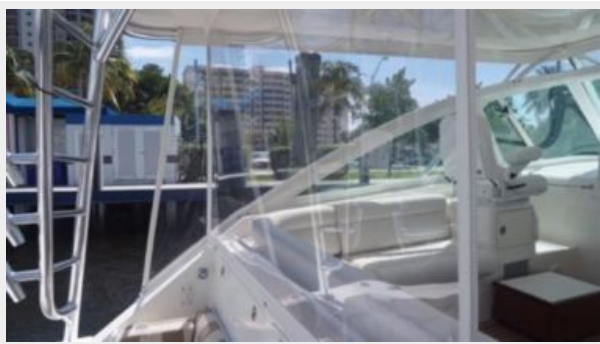
Excellent EZ2CY all around with Bridge AC