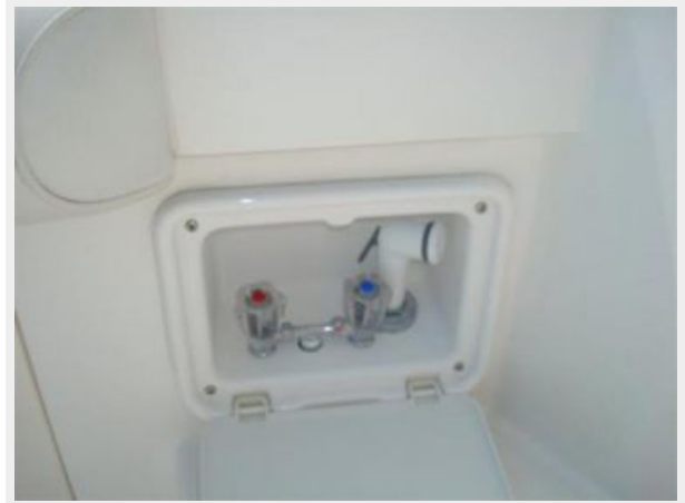
Hot and Cold shower