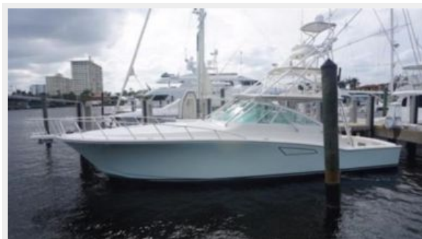
Port Side View