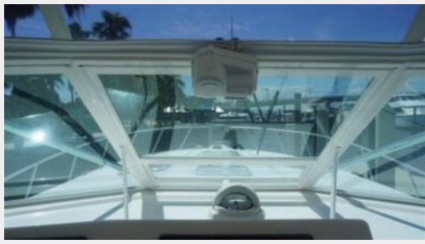
Helm View Forward