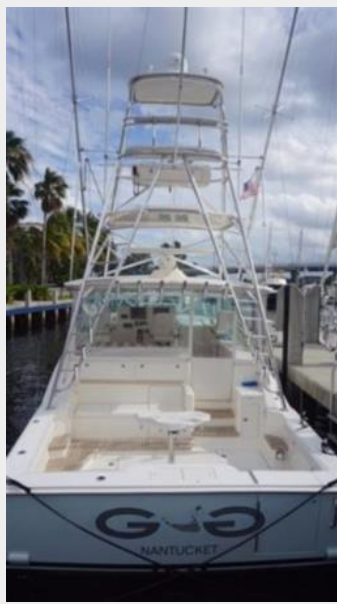
Stern View of Cockpit and Towner