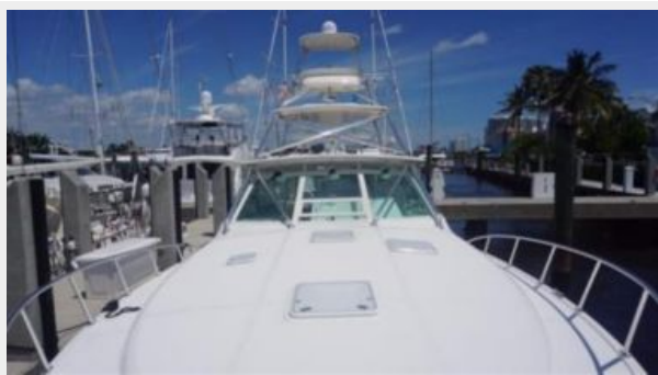
Fore Deck with Tower Shot