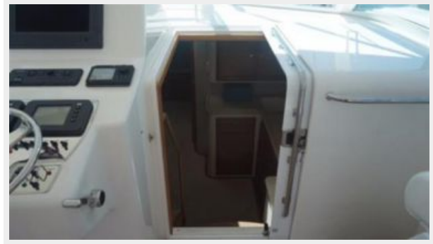
Salon Access from Bridge