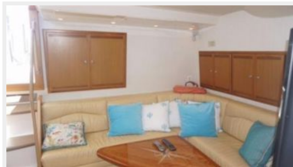
Salon L Sofa with Custom Articulating Table