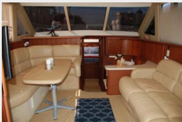
Salon View Forward