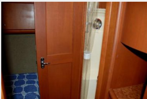
Guest Shower Entrance