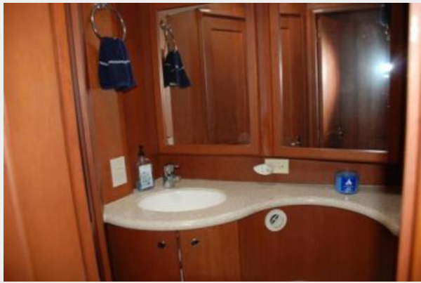
Master And Guest Head