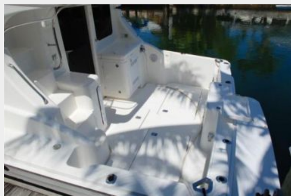
Cockpit Starboard View