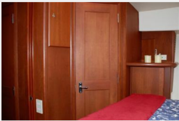
Master Side View