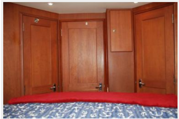
Master View Aft