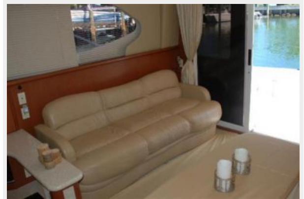
Salon Convertible Settee Sleeper