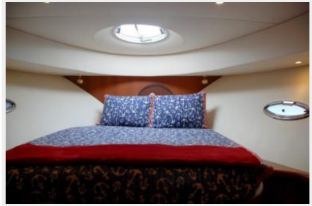
Master Statroom Forward