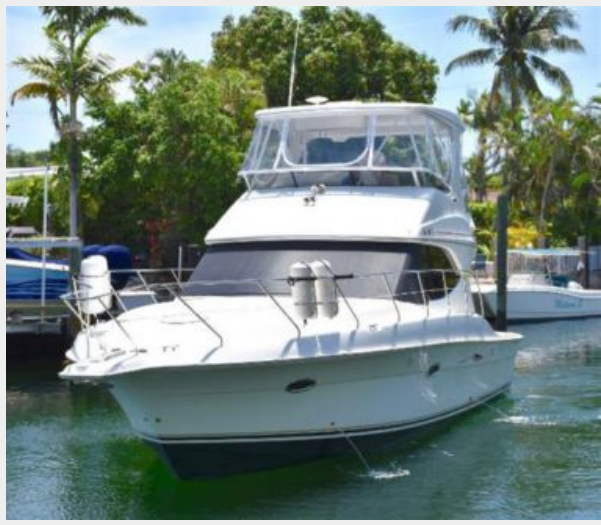
Forward Quarter View