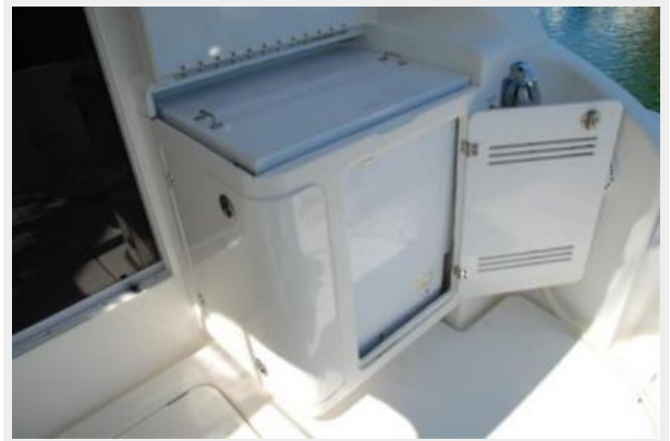
Custom Large Cockpit Freezer