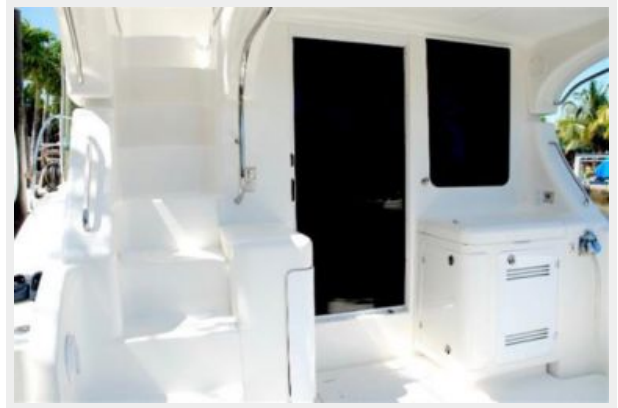
Salon Entrance Door