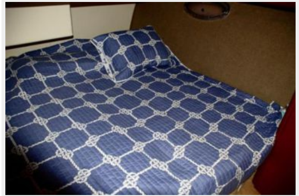
Guest Stateroom Portside