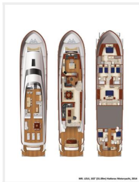
MR. LOUI, 102' (31.09m) Hatteras Motoryacht, 2014