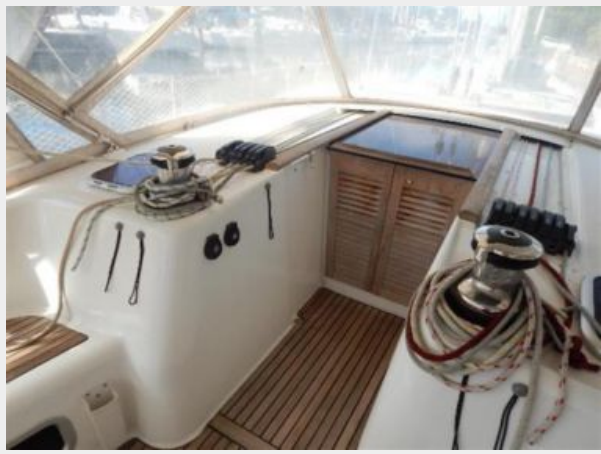
Companionway - Electric winch