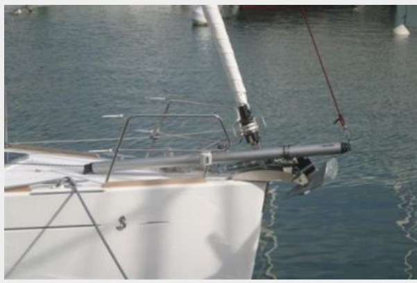
Bow with Sprit