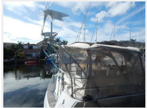
Stern Arch - (2) wind generators