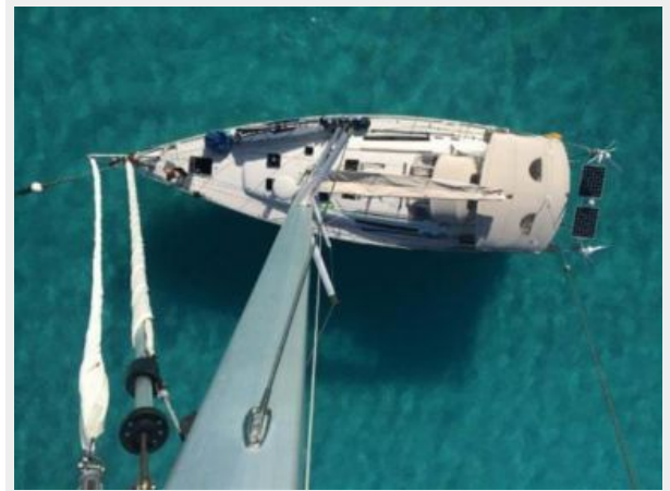
view from the mast head