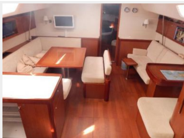
Salon - Looking Forward