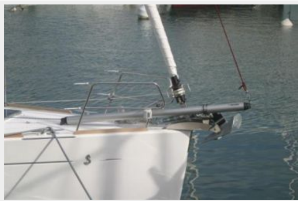
Bow with Sprit