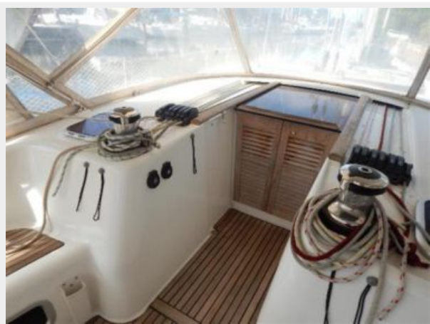
Companionway - Electric winch