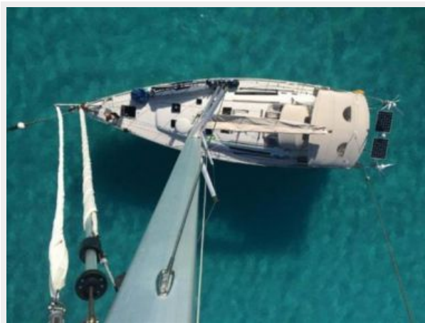
view from the mast head