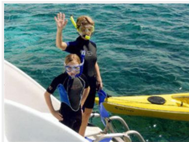
Enjoying Water Sports