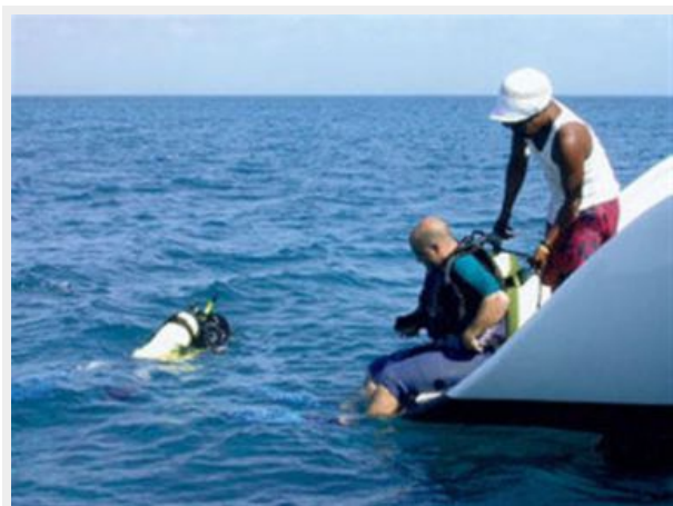
Scuba Diving off Transom