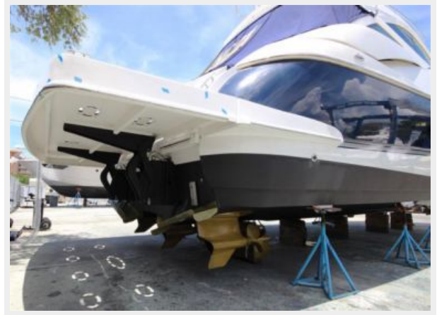
Starboard Aft Quarter