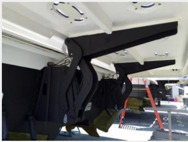
Hydraulic Platform Lift- June 2016