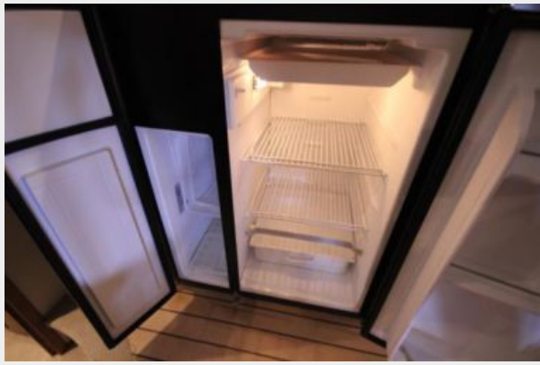
Fridge and Freezer