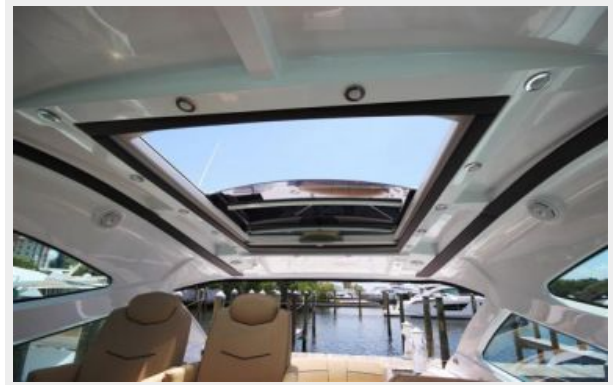
Power Sun Roof