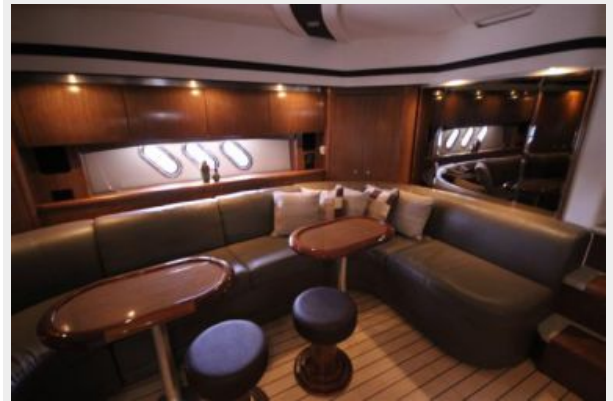
Starboard Aft Salon