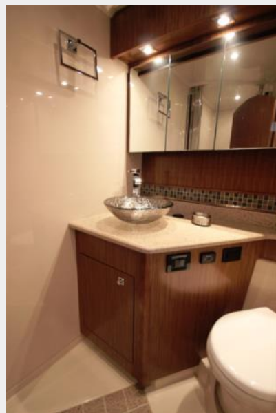
Master Private Head