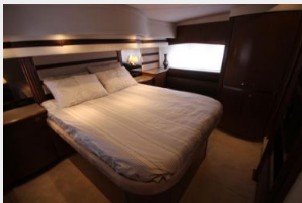
Port Aft Master Stateroom