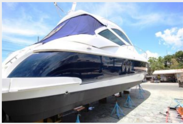
Fresh Buff and Wax - June 2016