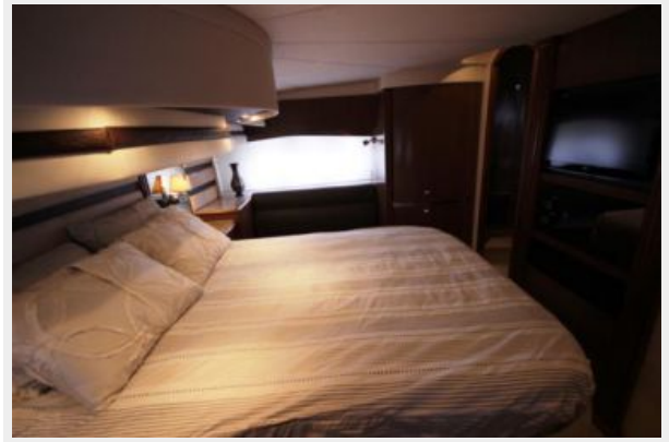
Port Master Stateroom