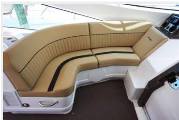
Port Helm Area