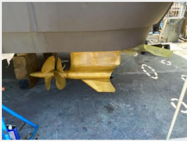
New Prop Speed on Drives =June 2016