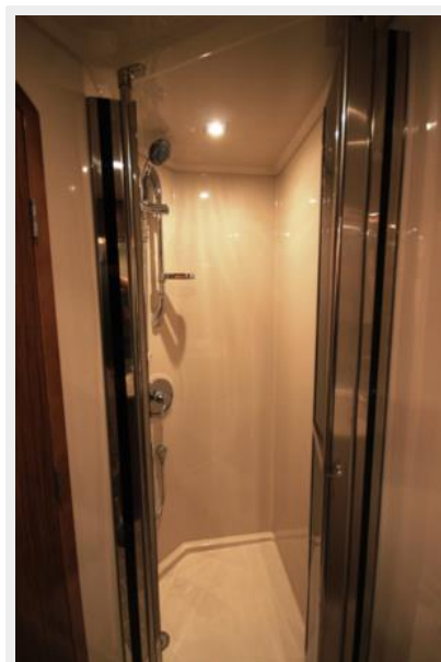
Master Private Shower