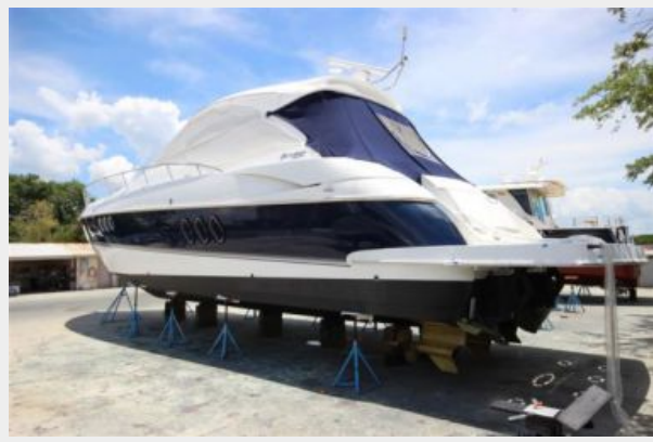
Port Aft Quarter