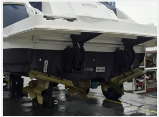
Prop Speed on 3 Pods