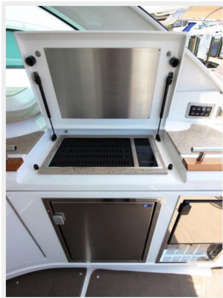
"NEVER Used Grill