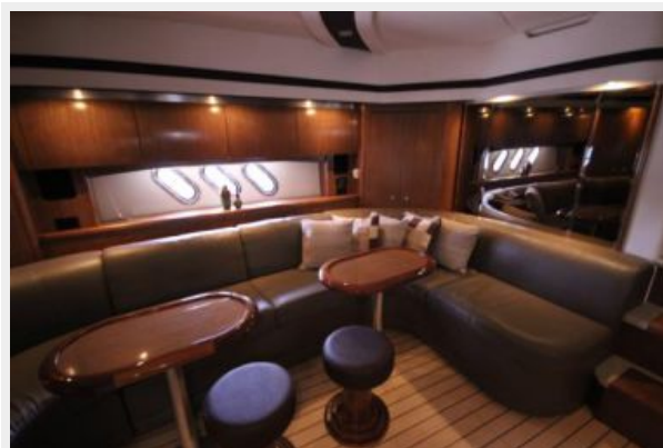
Starboard Aft Salon