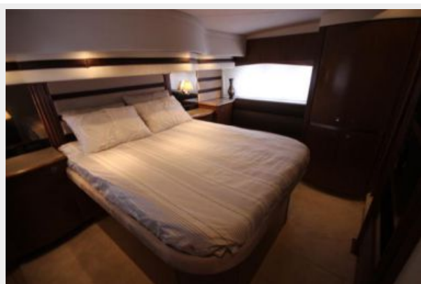
Port Aft Master Stateroom