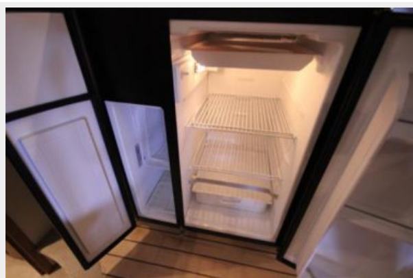
Fridge and Freezer