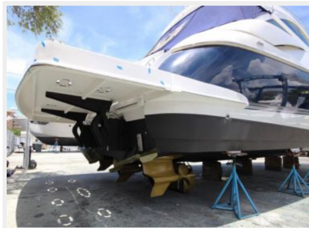
Starboard Aft Quarter