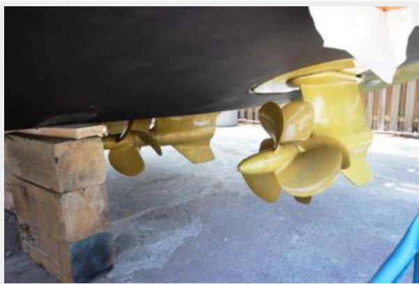
New Prop Speed