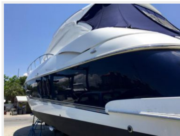
Beautiful Hull Condition