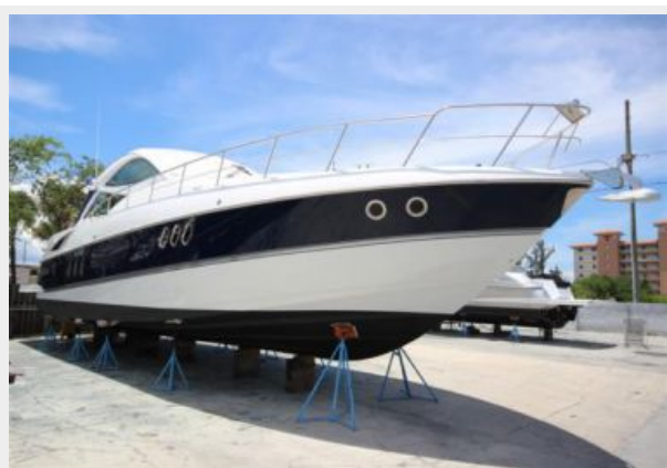
Starboard Hull- June 2016