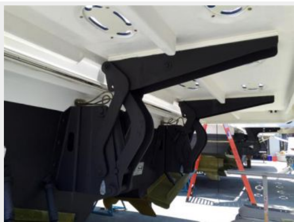
Hydraulic Platform Lift- June 2016