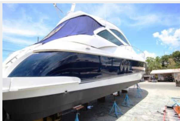
Fresh Buff and Wax - June 2016