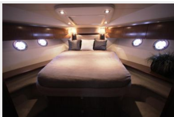
VIP Forward Berth