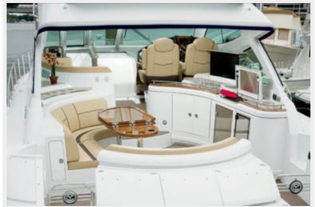
Manufactures Cockpit Image with Same Mocha