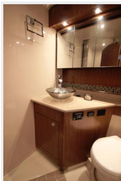
Master Private Head