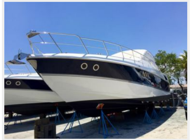
Port Hull - June 2016