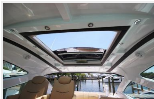
Power Sun Roof