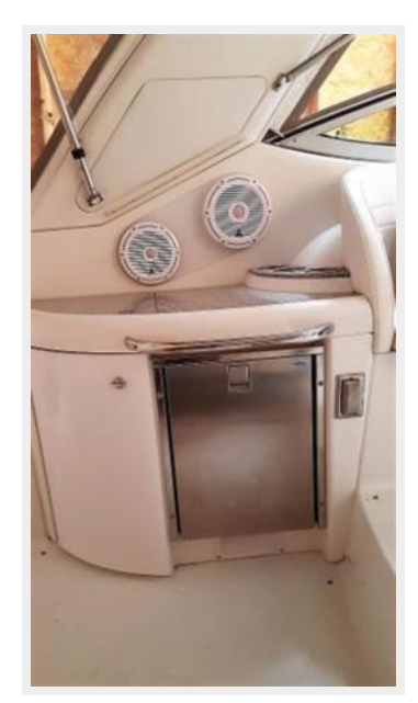
Looking forward to port