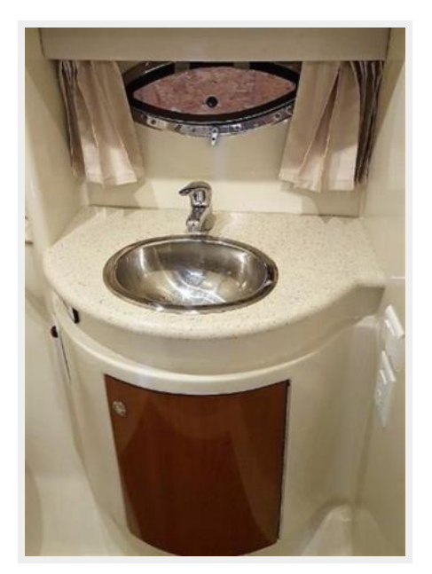
Manufacturer Provided Image: Aft Cabin