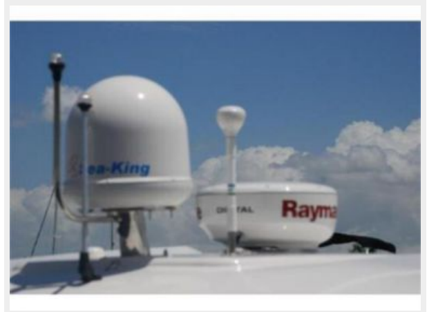
DSS & Hardtop