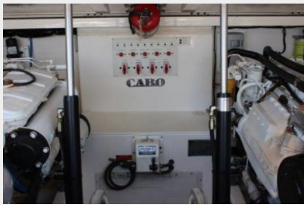
Engine & Mechanical Equipment 2 - Engine Room