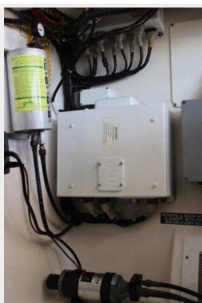
Engine & Mechanical Equipment 6 - Engine Room