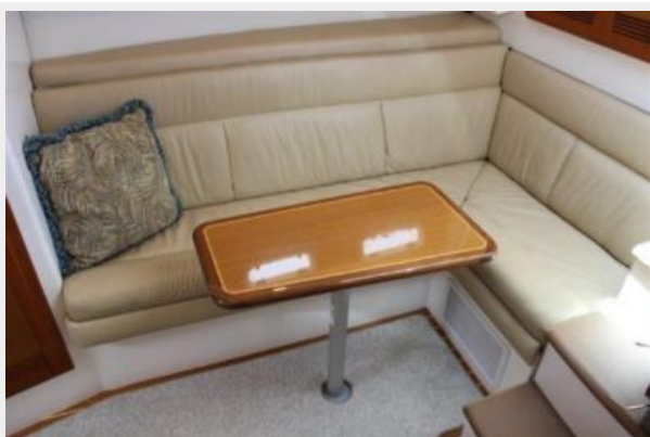
Main Cabin 4 - Convertible Dinette