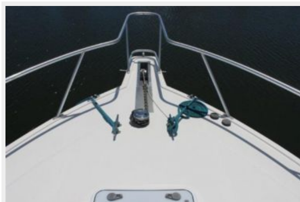
Deck 4 - Windlass