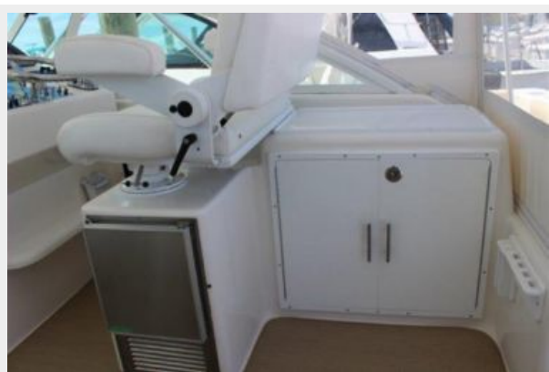
Deck 13 - Helm Deck