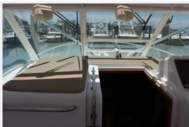
Deck 11 - Dash Carpet