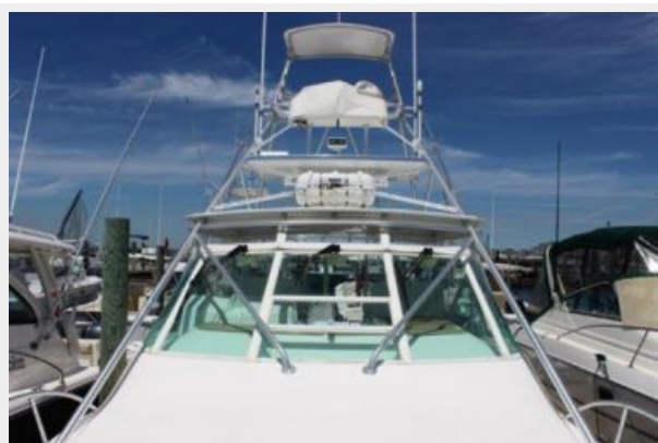
Deck 1 - Tower