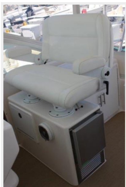
Deck 5 - Helm Seat