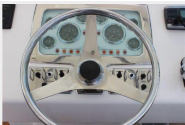
Helm / Electronics & Navigation 4