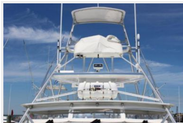
Deck 2 - Tower