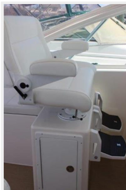
Deck 8 - Stidd Companion Seat