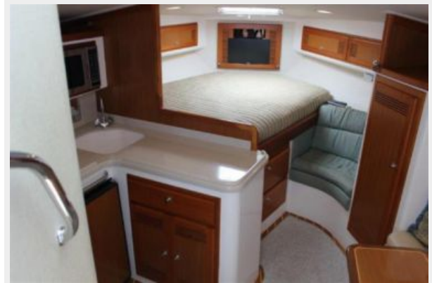
Main Cabin 1