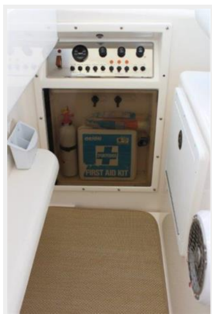
Deck 15 - Helm Deck Storage