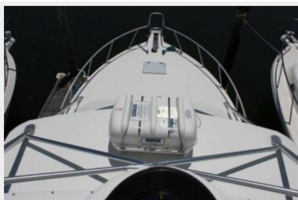
Deck 3 - View From Tower