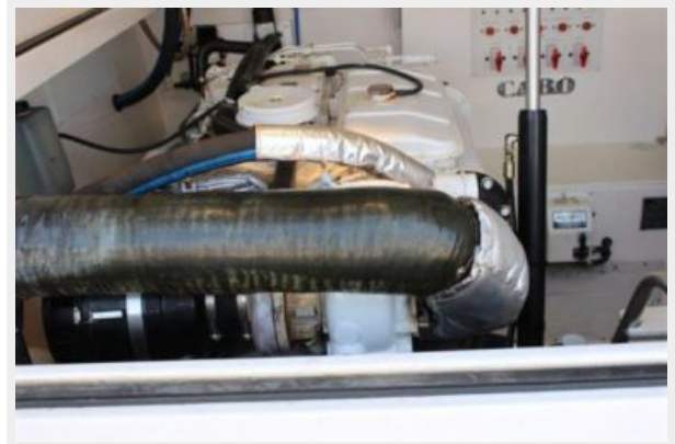
Engine & Mechanical Equipment 3 - Port Engine