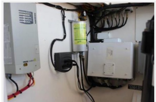
Engine & Mechanical Equipment 5 - Engine Room