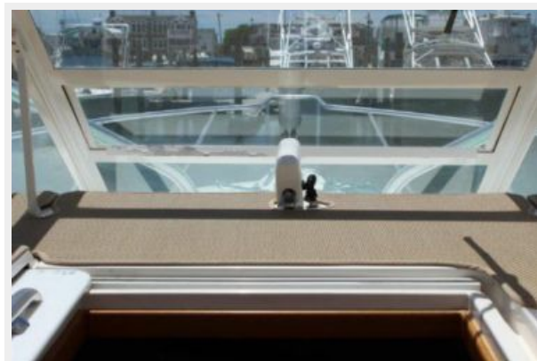
Deck 12 - Helm Power Vent Window