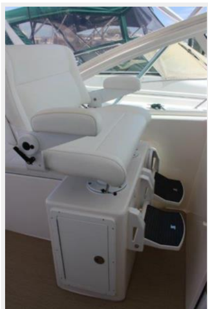
Deck 7 - Companion Seat