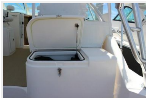
Deck 14 - Drink Box