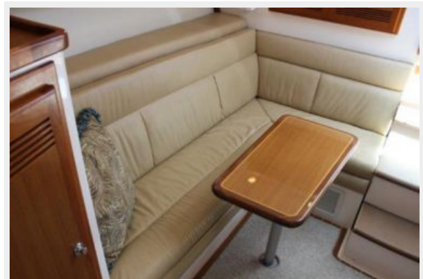
Main Cabin 3 - Dinette