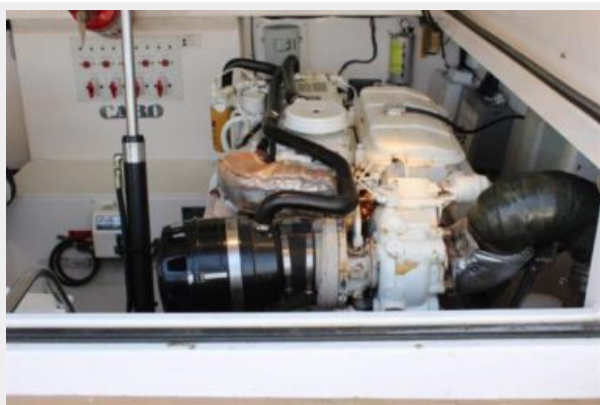
Engine & Mechanical Equipment 4 - Starboard Engine