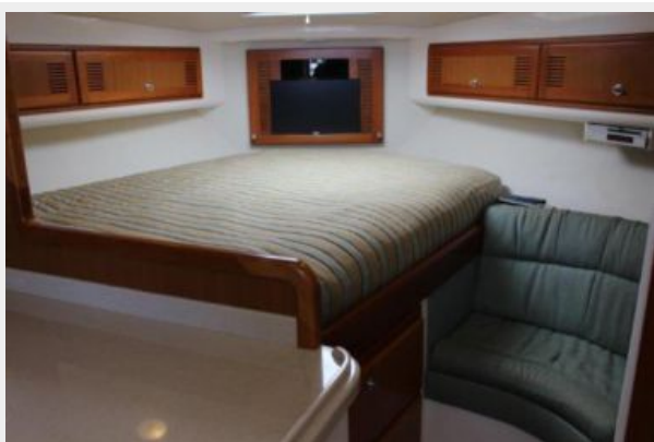
Main Cabin 2 - Forward Berth