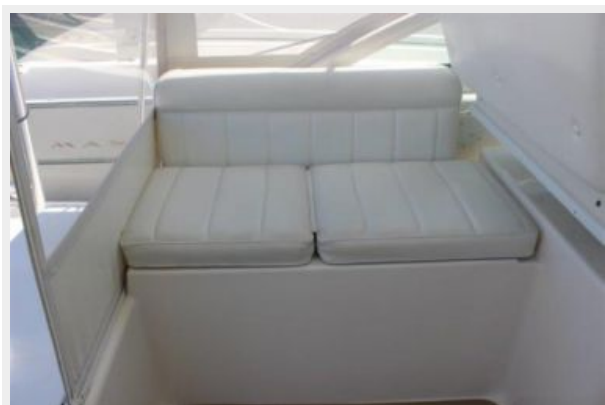
Deck 9 - Helm Deck Seating