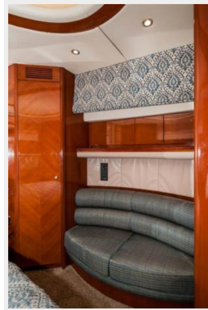
VIP Stateroom Seating