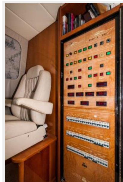
Breaker Box in Lower Helm