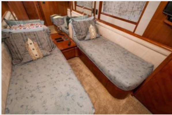
Guest Stateroom 1