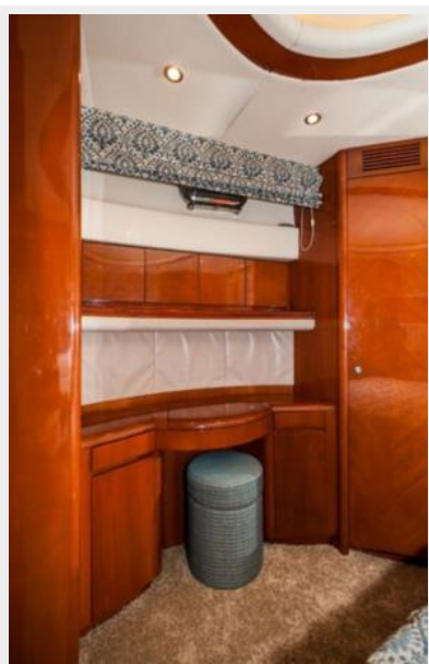
VIP Stateroom Vanity