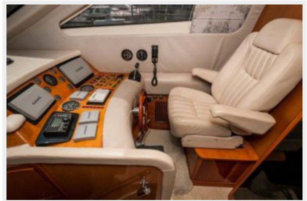
Breaker Box in Lower Helm