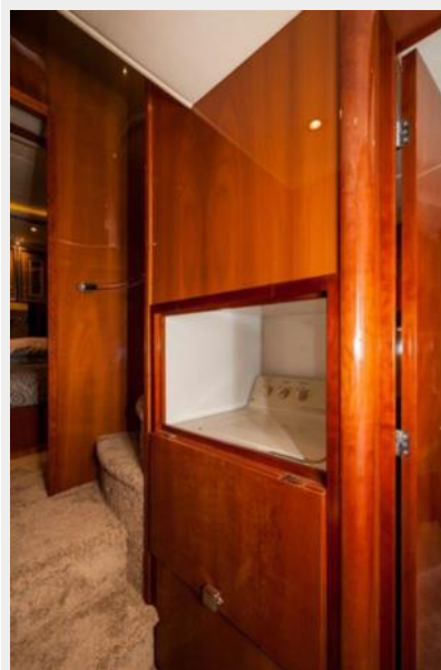
Laundry in Guest Stateroom