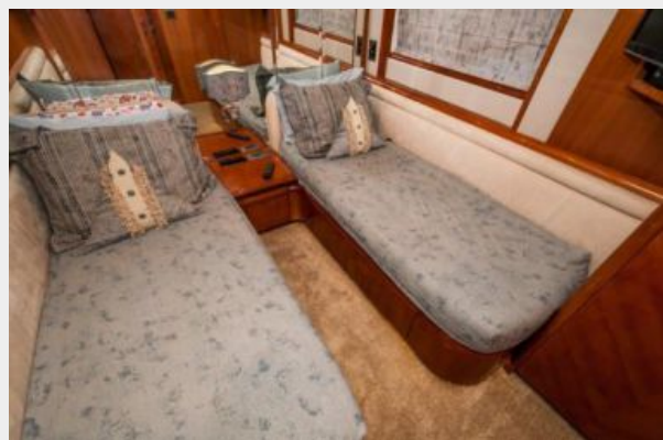
Guest Stateroom 1