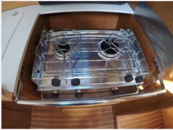
ENO two burner stove and oven