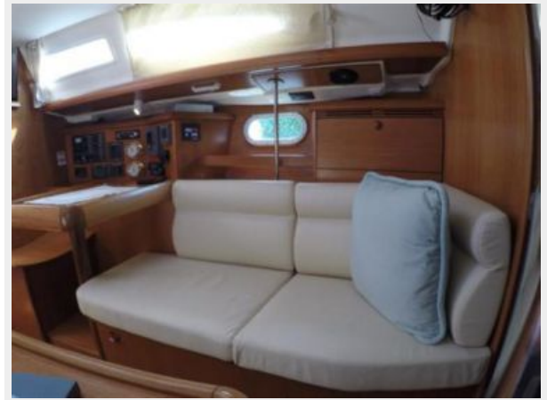
Port seating and aft navigation station