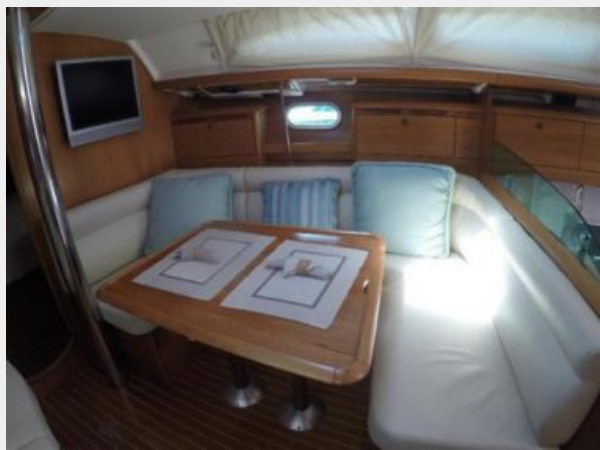
Starboard salon seating