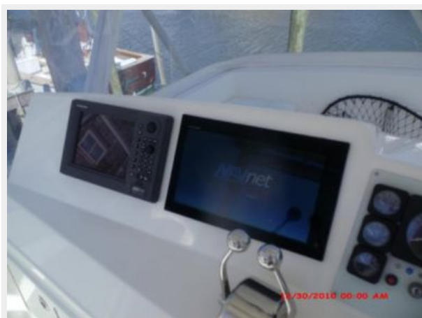
Helm / Electronics & Navigation 2