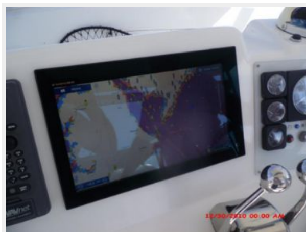
Helm / Electronics & Navigation 3