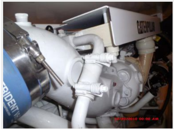
Engine & Mechanical Equipment 4