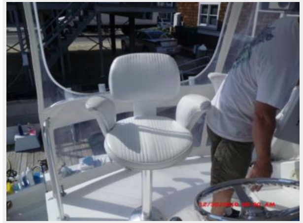
Deck 2 - Helm Seat