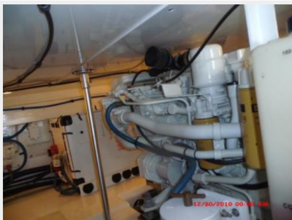
Engine & Mechanical Equipment 5