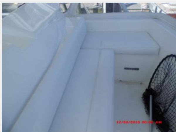
Deck 3 - Helm Deck Seating