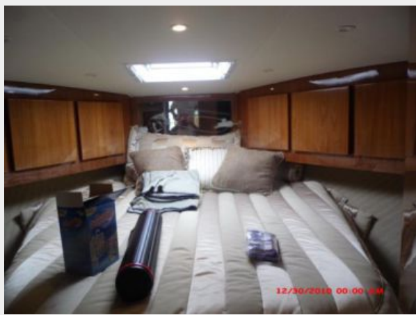
Master Stateroom 1