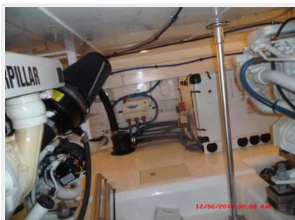
Engine & Mechanical Equipment 1