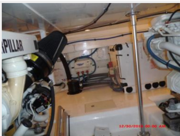
Engine & Mechanical Equipment 1