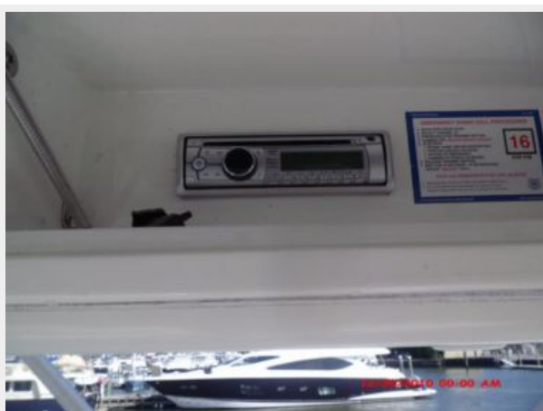
Helm / Electronics & Navigation 4