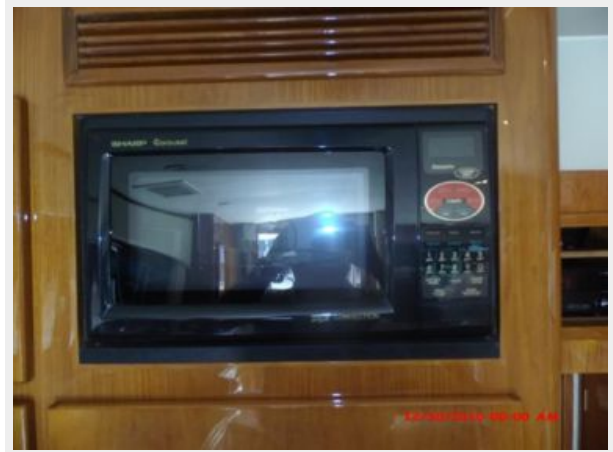
Galley 1 - Microwave Oven