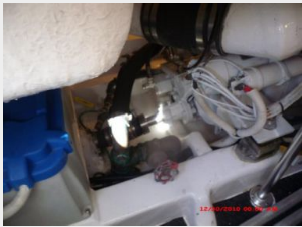
Engine & Mechanical Equipment 3