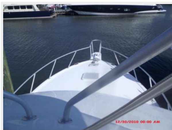
Deck 4 - Bow