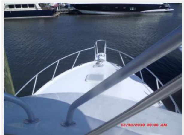
Deck 4 - Bow