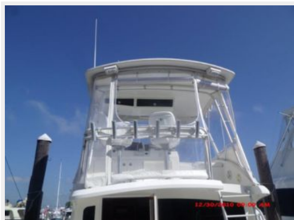
Deck 1 - Helm Deck