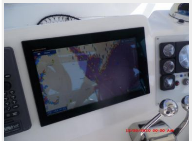
Helm / Electronics & Navigation 3