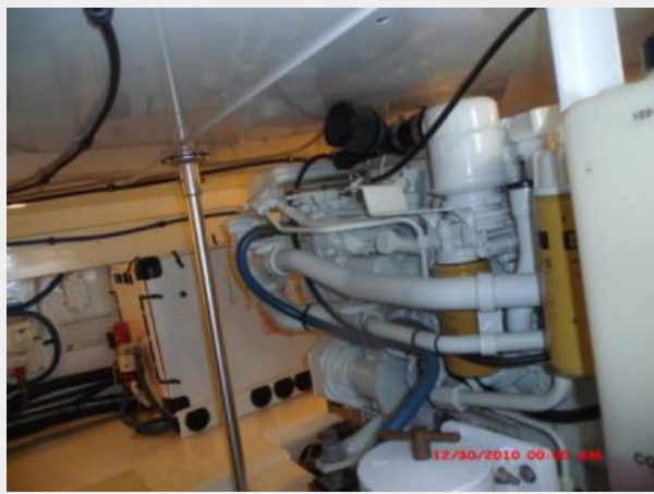
Engine & Mechanical Equipment 5