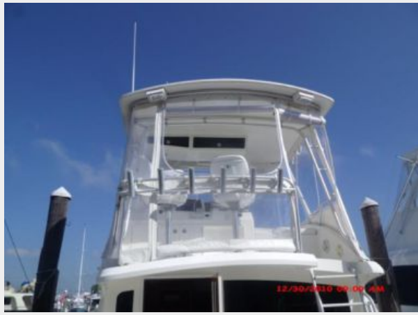
Deck 1 - Helm Deck