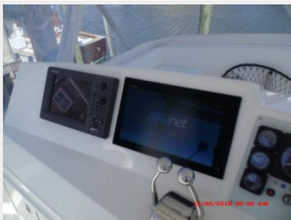
Helm / Electronics & Navigation 2