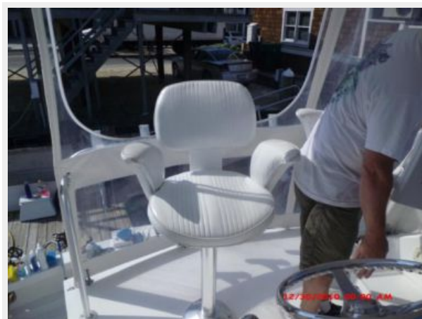
Deck 2 - Helm Seat