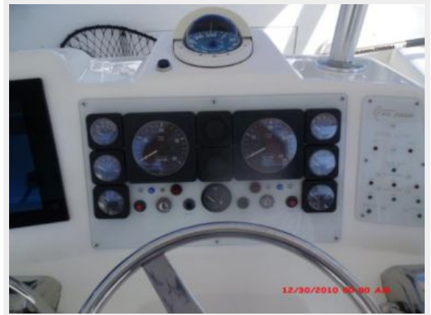
Helm / Electronics & Navigation 1