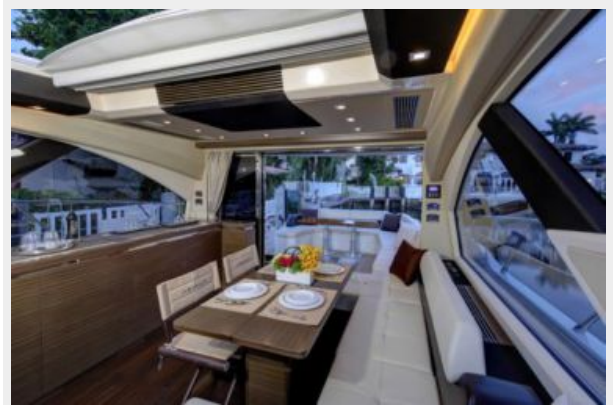
Salon with open sunroof