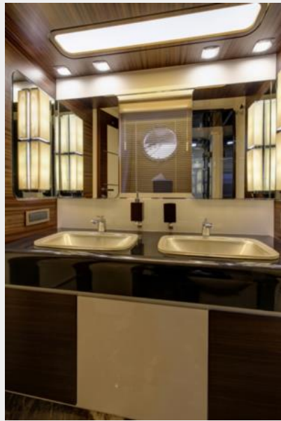
Master head sinks