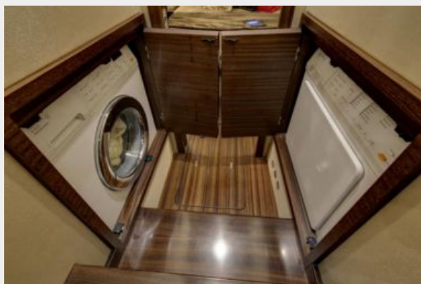
Separate washer and dryer