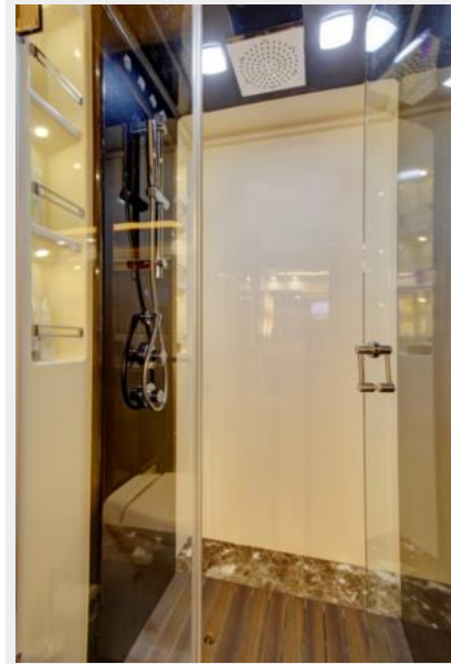
Master head shower