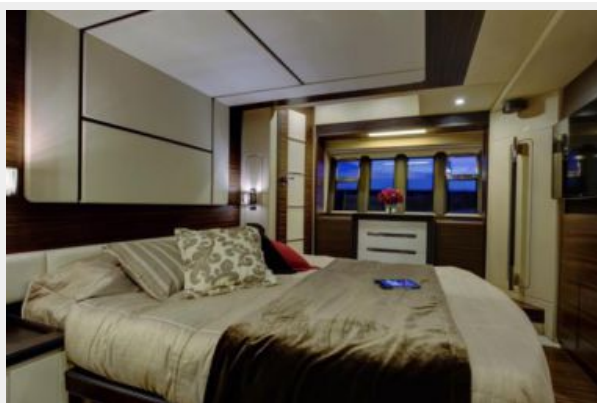
Master stateroom facing starboard