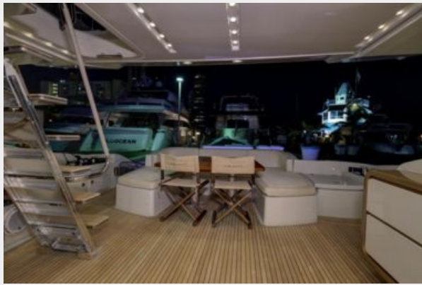
Aft deck facing stern