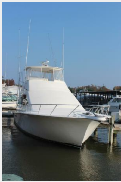
Profile 2 - Bow