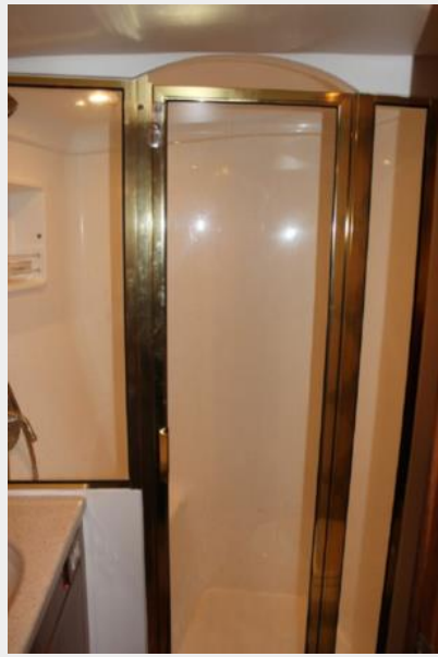
Master Head 3 - Shower