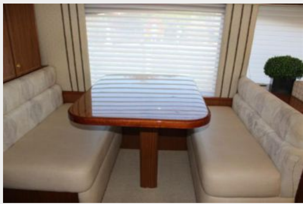
Salon 3 - Dinette