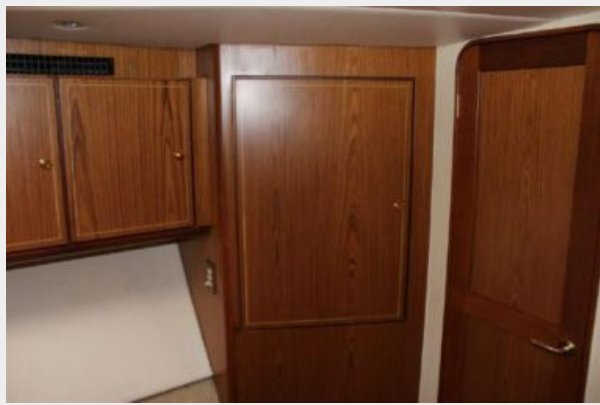
VIP Stateroom 3