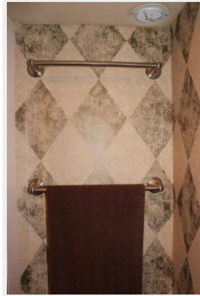
Master Head 4