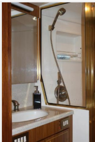
Master Head 1