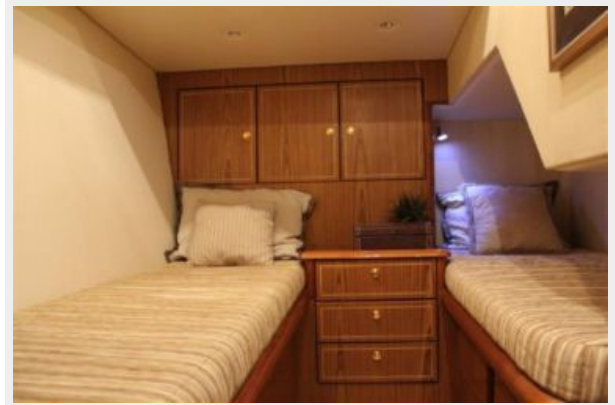
Guest Stateroom 1