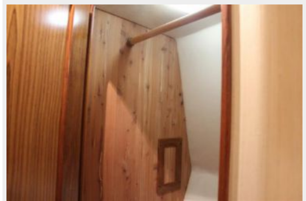
Guest Stateroom 3