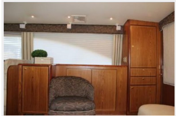
Salon 4 - Barrel Chair & Entertainment Center