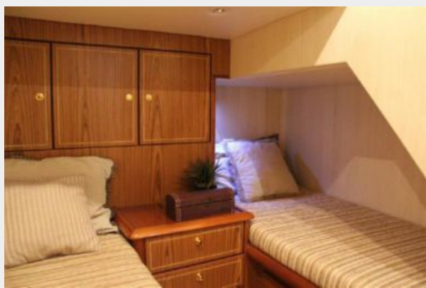
Guest Stateroom 2