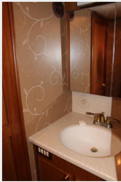
Day Head 1