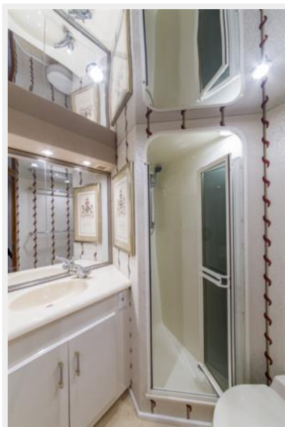
Forward Guest Head