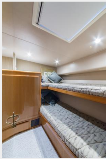
Guest Stateroom Amidship Starboard