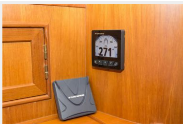
Remote Readout in Master Stateroom