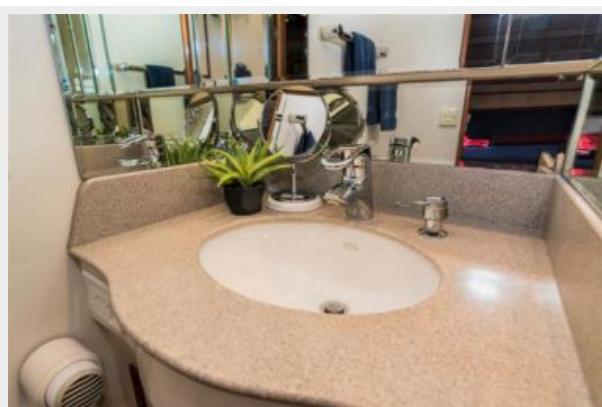
Master Stateroom Sink