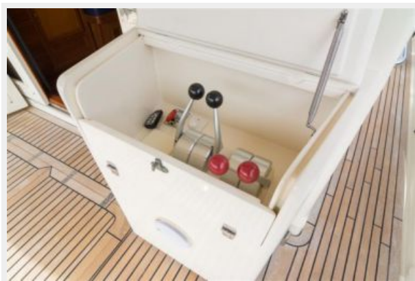
Cockpit Hydraulic Controls