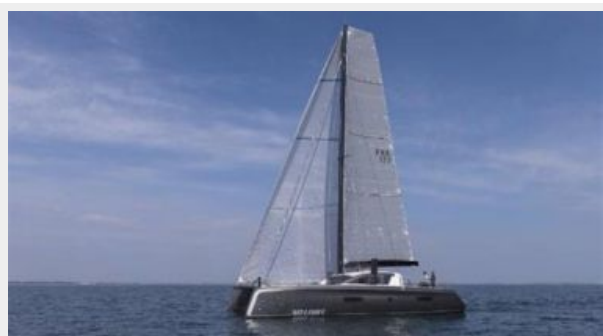
Outremer Carbon 60