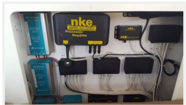
NKE electronic connection