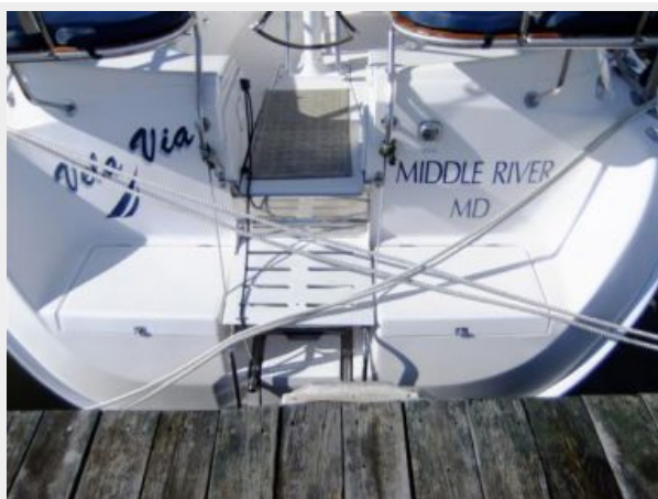
Hunter 41 DS Swimplatform