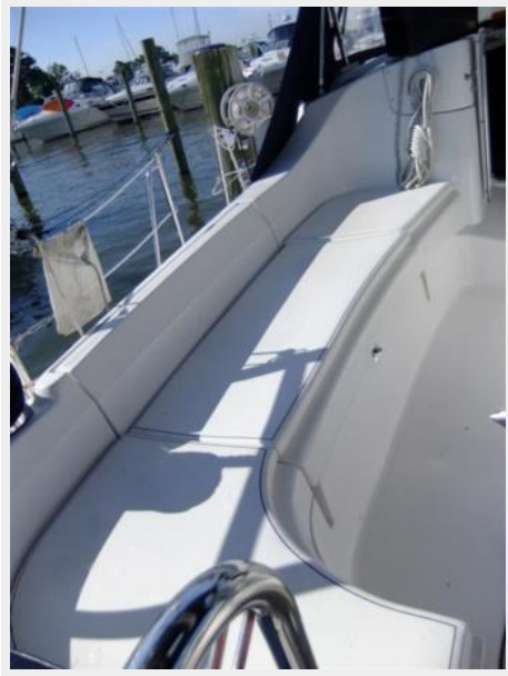
Hunter 41 DS Cockpit Seating Port