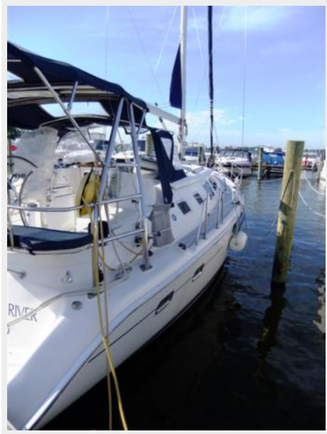
Hunter 41 DS Starboard Aft Profile