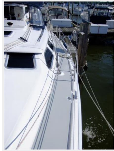
Hunter 41 DS Dodger with Hand Rail Port