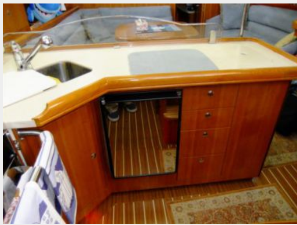
Hunter 41 DS Galley DBL Sink, Under Freezer, Cutting Board