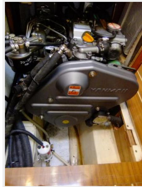
Hunter 41 DS Auxiliary