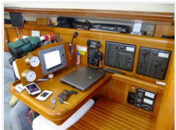
Hunter 41 DS Navigation Station photo1