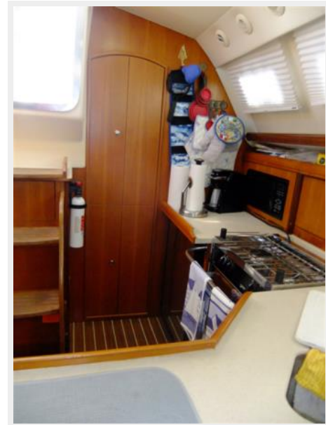
Hunter 41 DS Galley Pantry