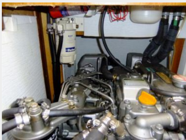
Hunter 41 DS Racor Fuel Filter