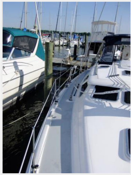
Hunter 41 DS Starboard Side Deck