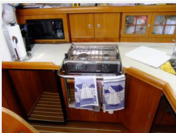
Hunter 41 DS Galley Oven & Burners