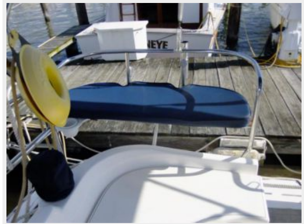
Hunter 41 DS Stern Pulpit Seat Starboard