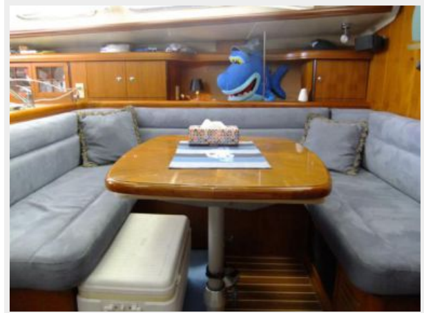
Hunter 41 DS Salon Settee photo2