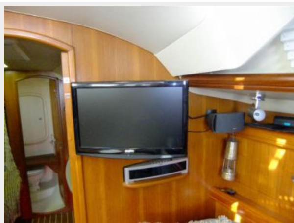
Hunter 41 DS Salon Entertainment System