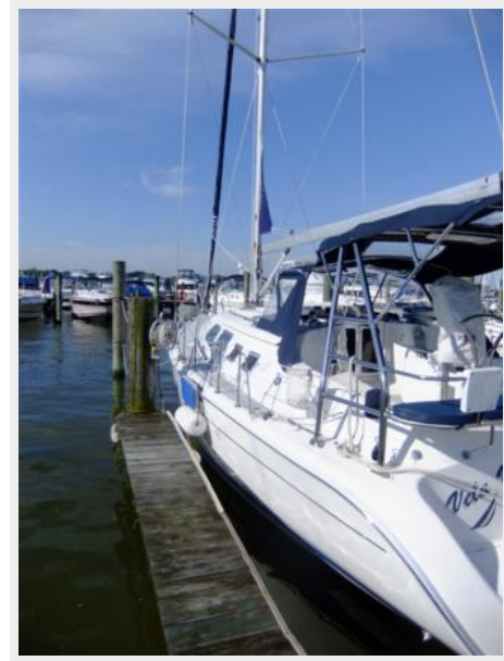
Hunter 41 DS Port Aft Profile