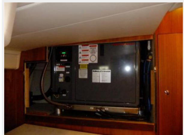
Hunter 41 DS Generator Side View