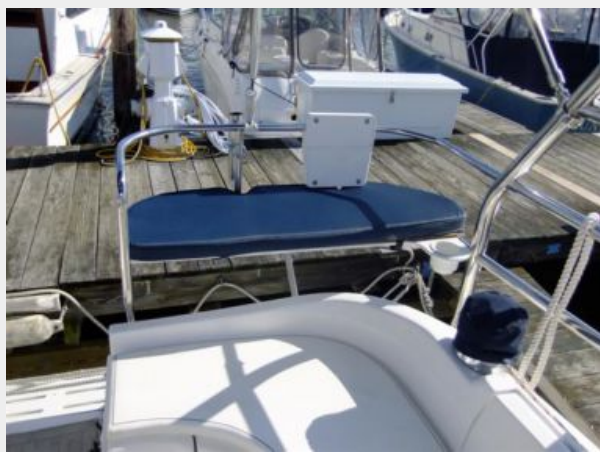
Hunter 41 DS Stern Pulpit Seat Port