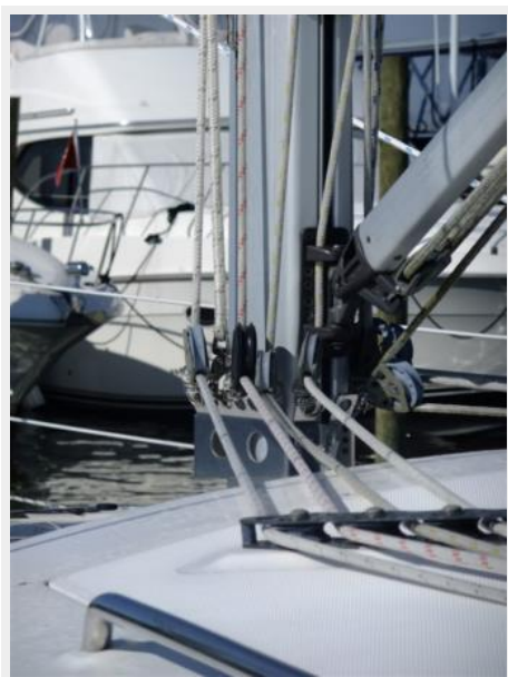
Hunter 41 DS Haylard Blocks & Lines to Aft