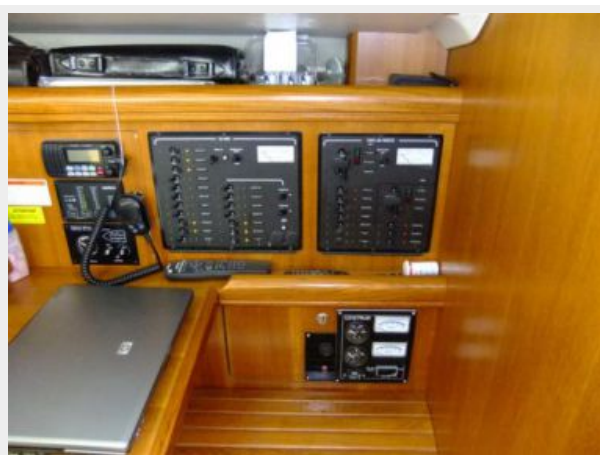
Hunter 41 DS Navigation Station photo2