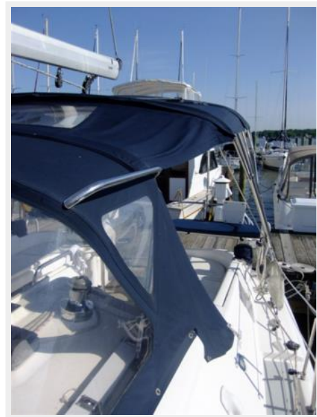
Hunter 41 DS Dodger with Hand Rail Port