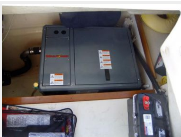
Hunter 41 DS Generator Top View