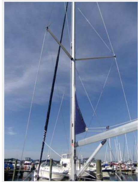
Hunter 41 DS Rigging