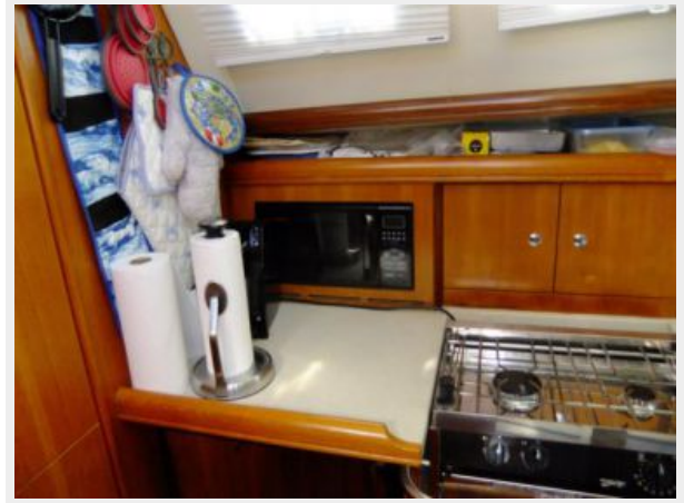
Hunter 41 DS Galley Microwave