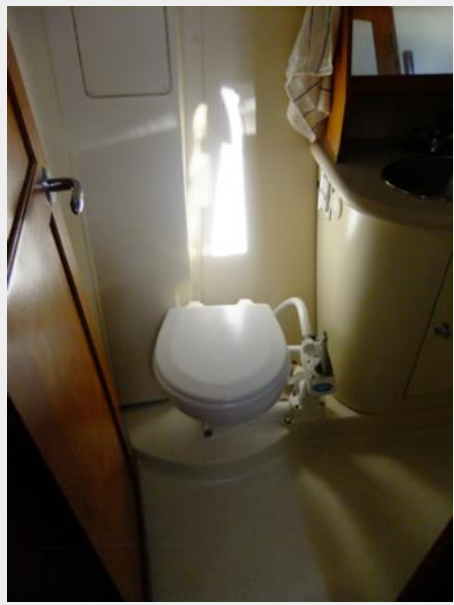
Hunter 41 DS Aft Stateroom Head