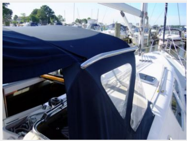
Hunter 41 DS Dodger with Hand Rail Starboard