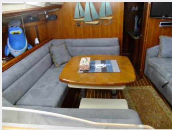
Hunter 41 DS Salon Settee photo1