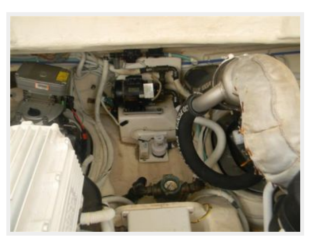
Engine Room Aft