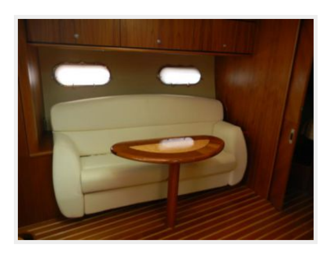
Salon Couch with Table