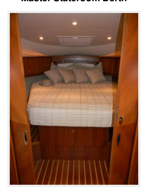
Master Stateroom Berth