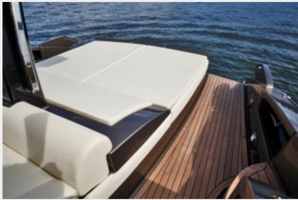
Cockpit Electric BBQ