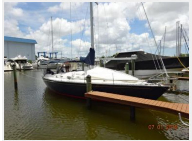
40' Hunter starboard forward profile