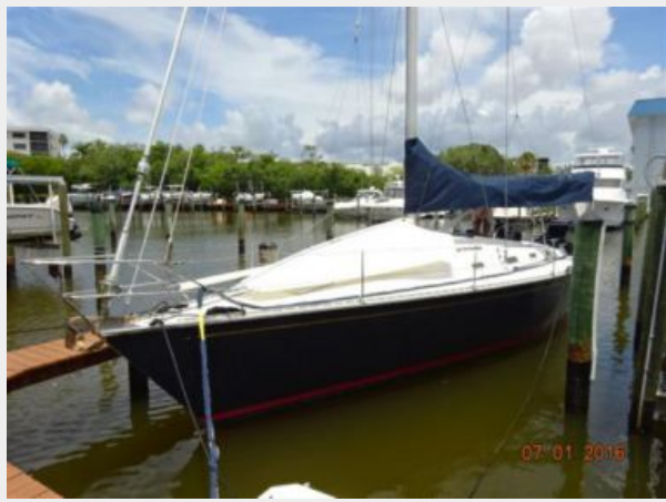
40' Hunter port forward profile