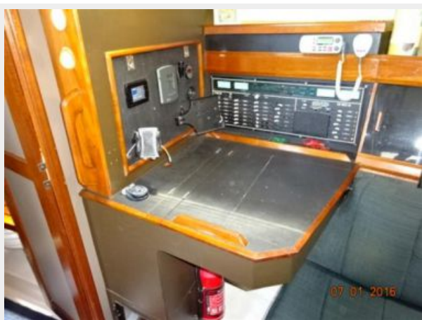
40' Hunter nav station