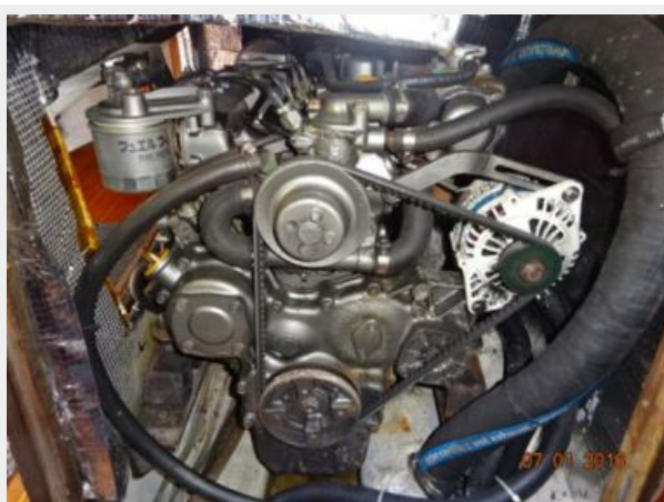
40' Hunter auxiliary photo2