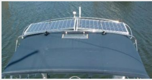
40' Hunter solar panels