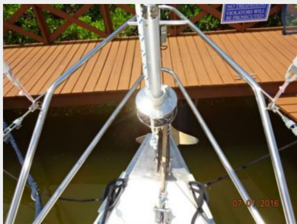
40' Hunter roller furler