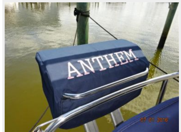
40' Hunter BBQ grill