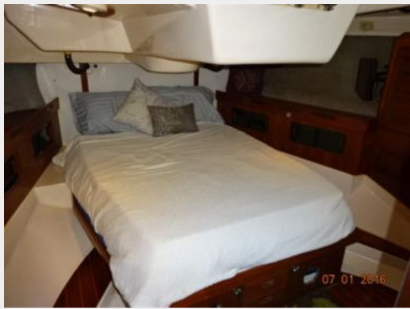
40' Hunter master stateroom photo2