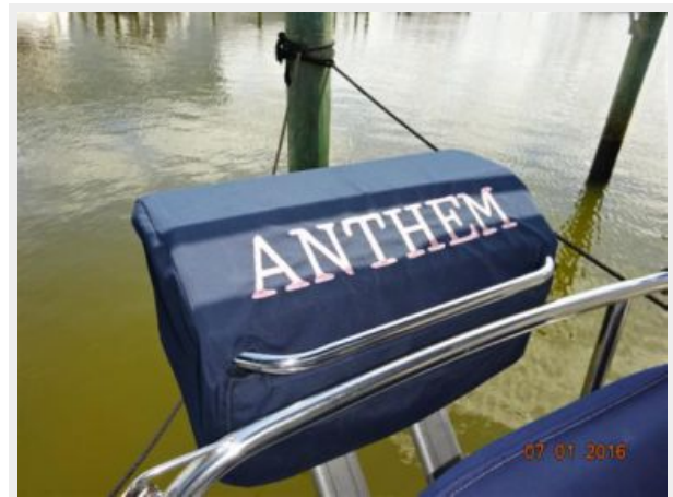
40' Hunter BBQ grill