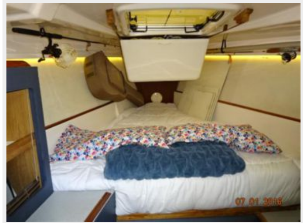
40' Hunter guest stateroom