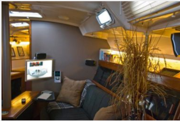
40' Hunter salon starboard seating photo2