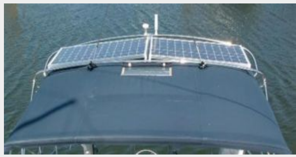
40' Hunter solar panels