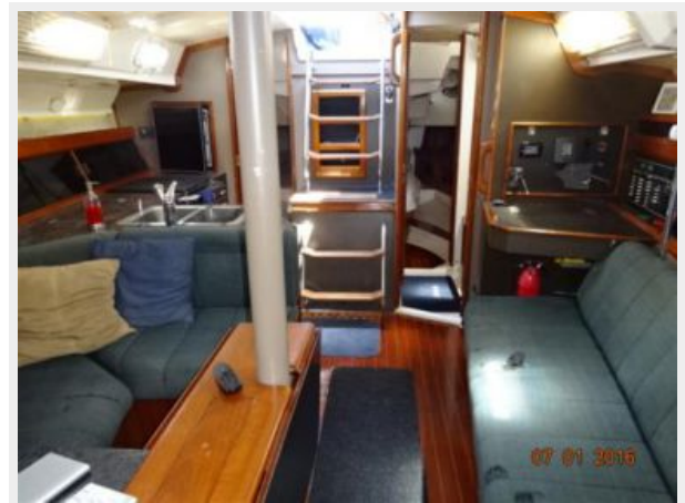
40' Hunter salon aft