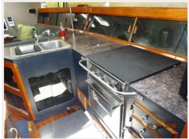
40' Hunter galley photo2