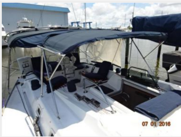
40' Hunter cockpit photo1