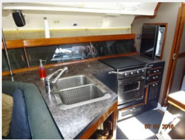
40' Hunter galley photo1