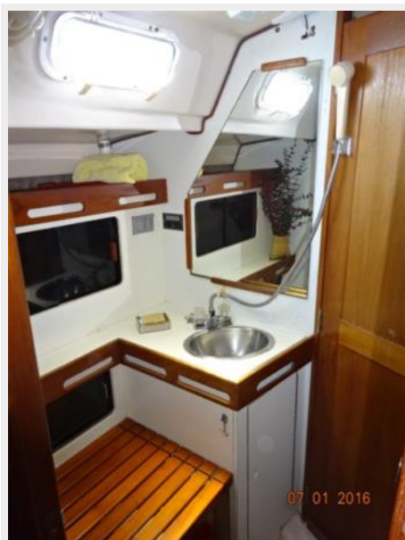
40' Hunter head