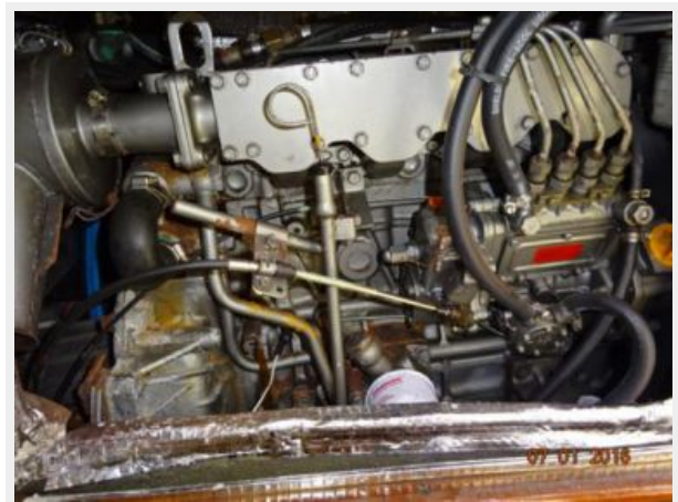
40' Hunter auxiliary photo1