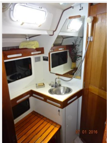
40' Hunter head