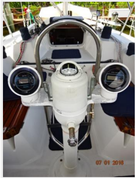
40' Hunter cockpit helm