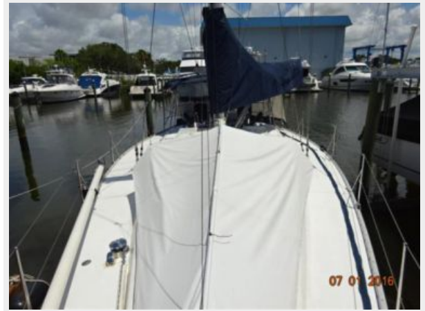
40' Hunter foredeck aft