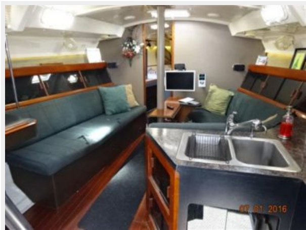
40' Hunter salon forward