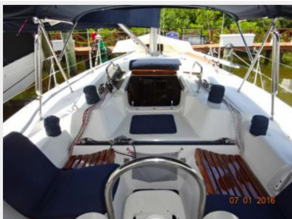
40' Hunter cockpit forward