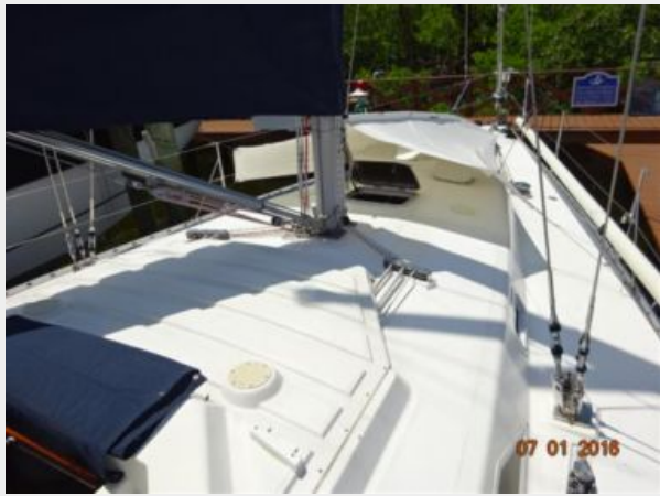
40' Hunter foredeck