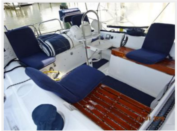
40' Hunter cockpit photo2