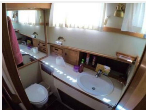
Full Shower in Master