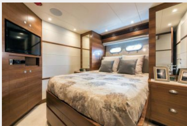
Port VIP Stateroom