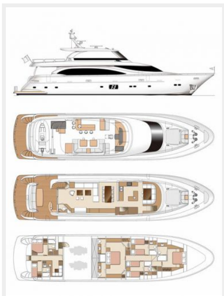
Open Bridge Layout