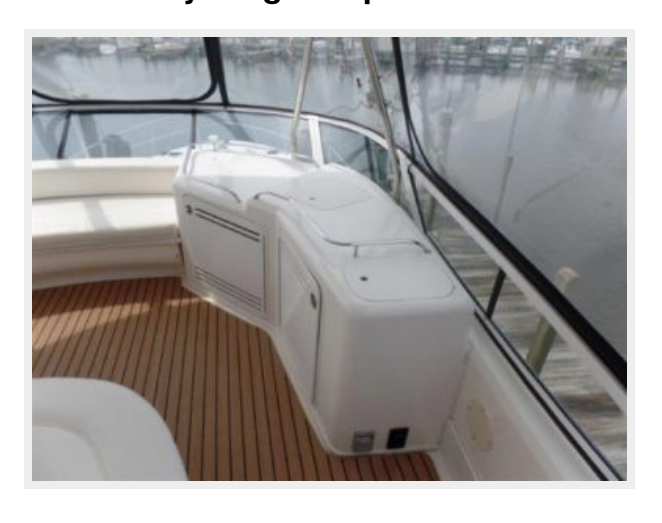
Flybridge Prep Station