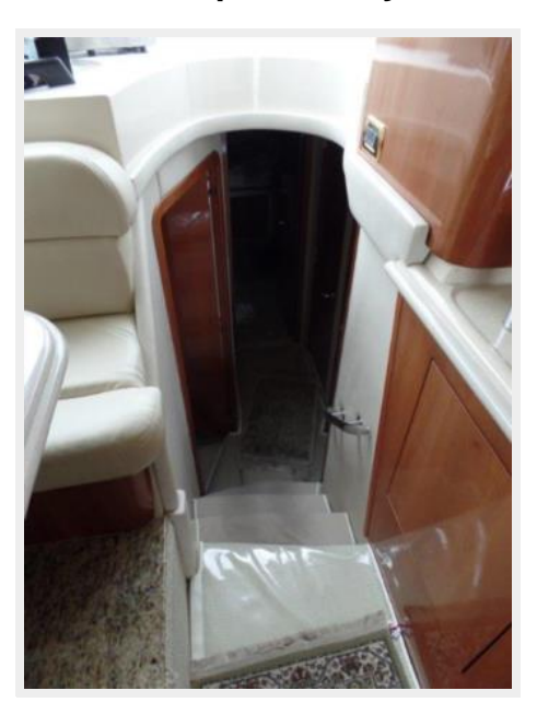
Master Stateroom Berth