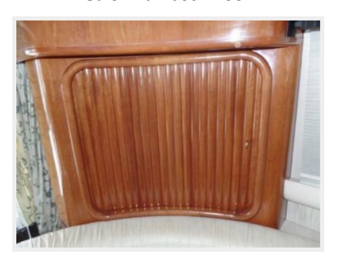
Salon Tambour Door