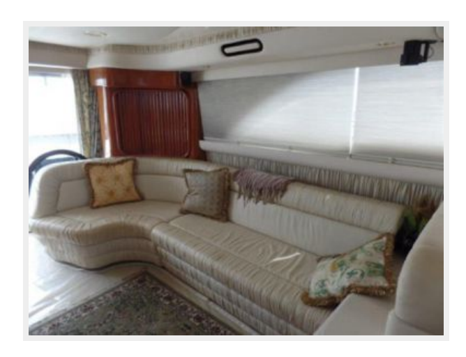
Salon Port Side