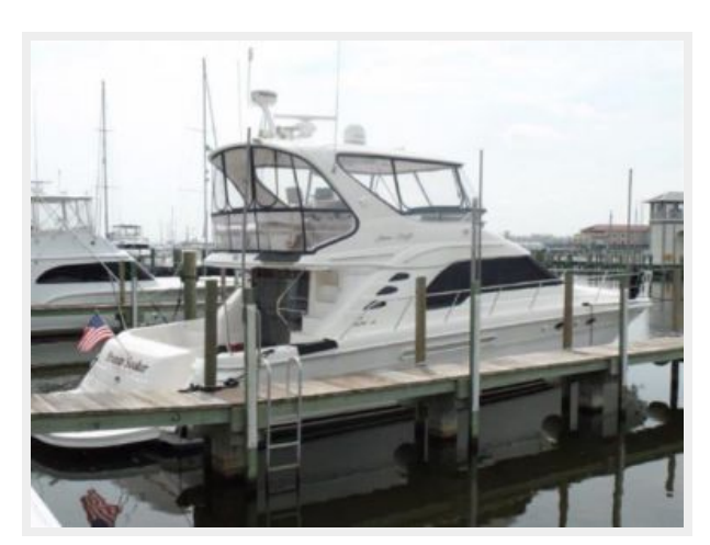
Starboard Profile at Dock