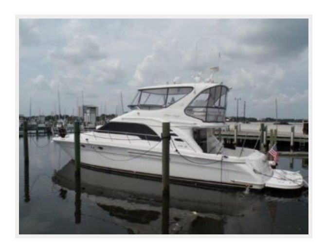
Port Profile at Dock