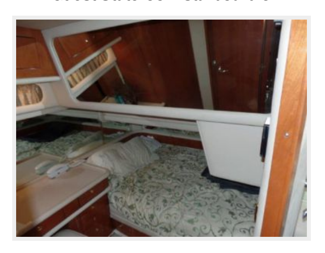
Guest Stateroom starboard 3