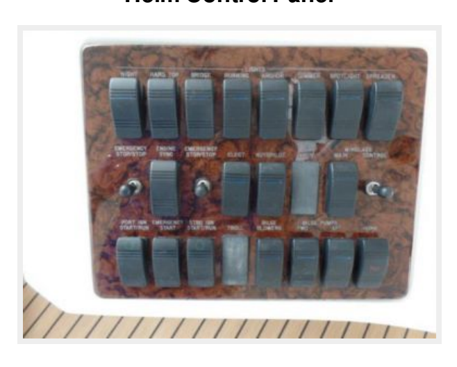
Helm Control Panel