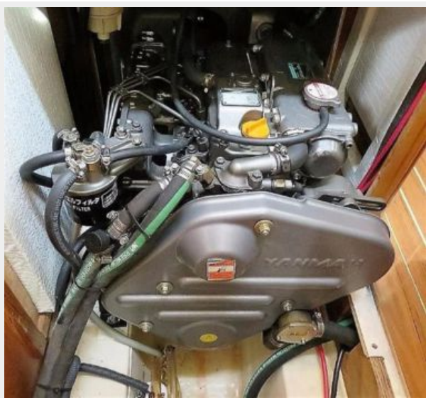
Super clean too