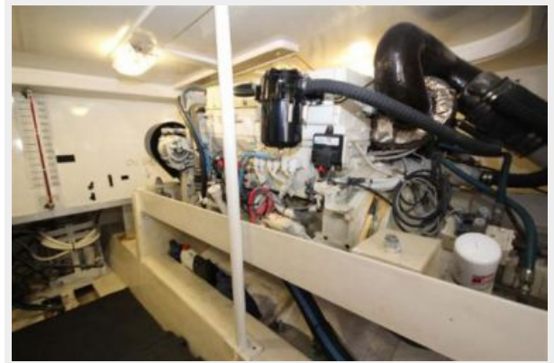
Starboard Engine 1