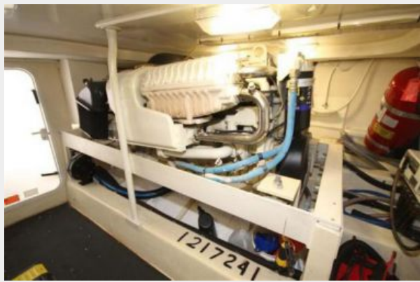
Port Engine 2