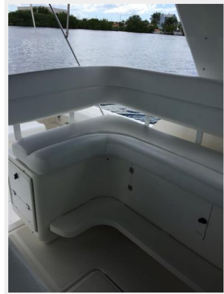
Companion Seat & Storage