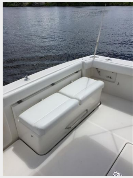
Aft Lounge Seating