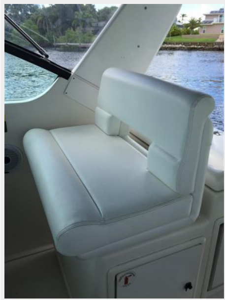
Double Helm Seat