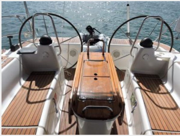
Bavaria 49 Cockpit