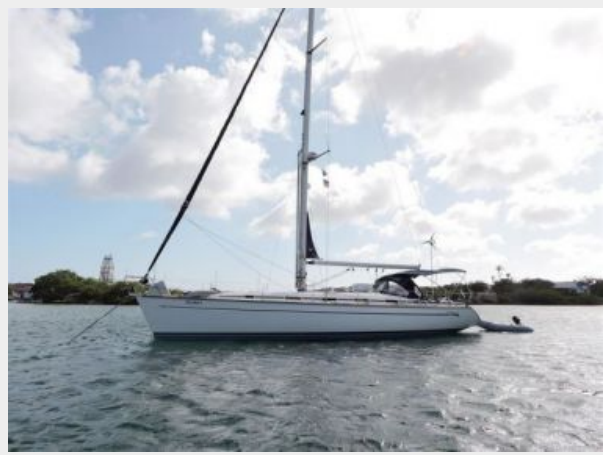
Bavaria 49 Curacao