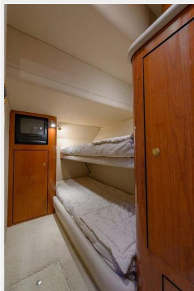
Port Guest Stateroom