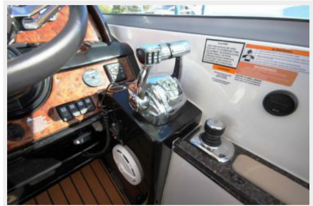
Joystick and Skyhook