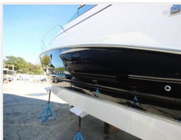
Like New Gelcoat