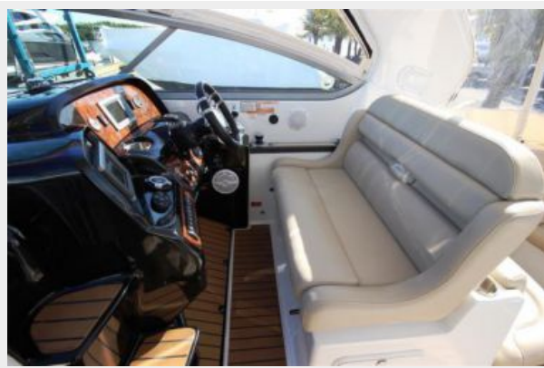
Thigh Ris Double Helm Chair