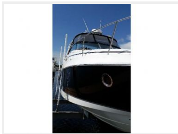
Starboard on Lift