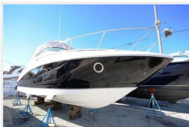
Starboard Forward Quarter