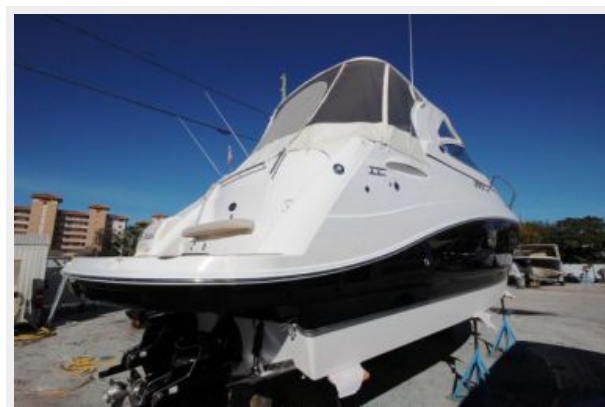
Starboard Aft Quarter